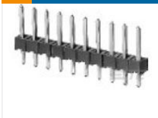
TE Part #5-146276-2 02 MODII HDR SRST B/A .100CL