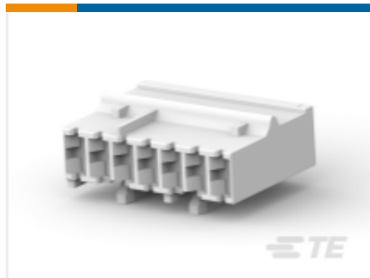
TE Part #5-2295787-7 STD TIMER PLUG HSG 7P W/EXT. LOCKING-SP