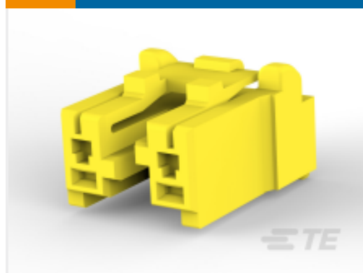
TE Part #1-1747050-4 GIC 7.92 2POS PLUG YELLOW KEYING B