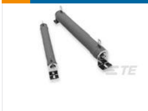
TE Part #2-1879453-5 TE 1000W 100R 5% Bracket