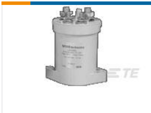
TE Part #9-1618389-8 LEV100A5ANG=RELAY, SPST, 24Vdc