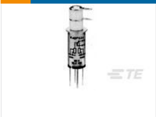
TE Part #1618239-7 K40P332=RELAY VACUUM SPST LATC