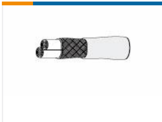
TE Part #913237-000 55A1811-20-9-9CS2275