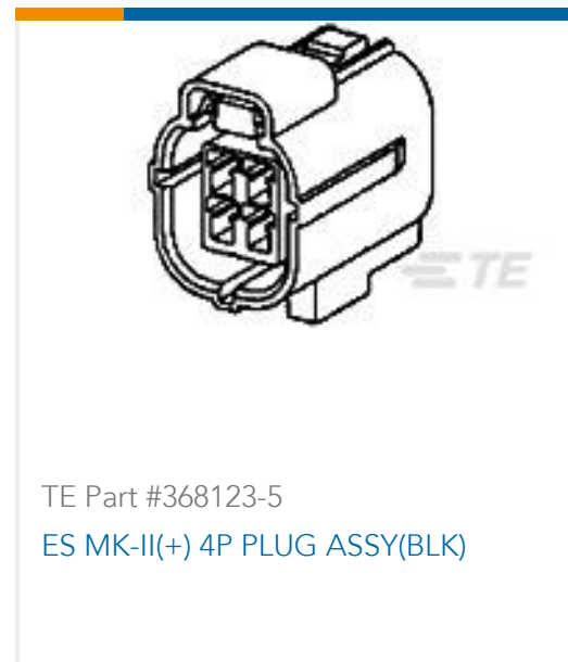
TE Part #368123-5 ES MK-II(+) 4P PLUG ASSY(BLK)