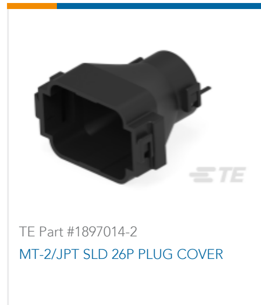
TE Part #1897014-2 MT-2/JPT SLD 26P PLUG COVER