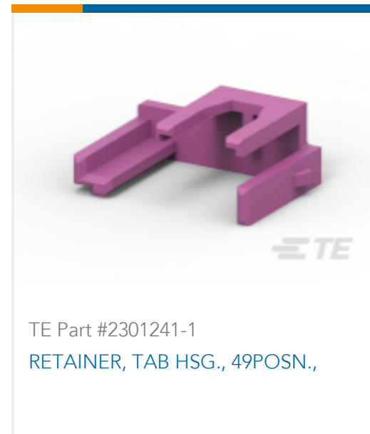
TE Part #2301241-1 RETAINER, TAB HSG., 49POSN.,