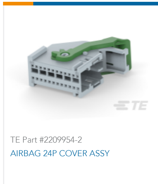
TE Part #2209954-2 AIRBAG 24P COVER ASSY