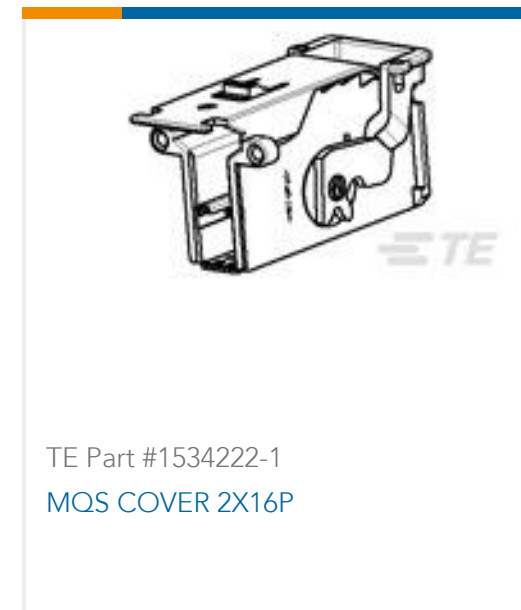
TE Part #1534222-1 MQS COVER 2X16P