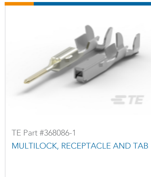
TE Part #368086-1 MULTILOCK, RECEPTACLE AND TAB