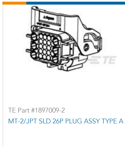
TE Part #1897009-2 MT-2/JPT SLD 26P PLUG ASSY TYPE A