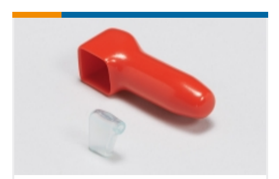
Insulation Boots & Sleeves(7)