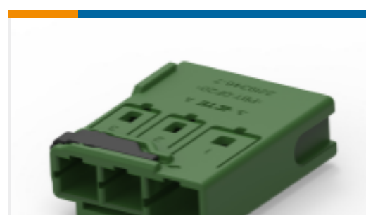
TE Part #2219346-7 RF S/L HYB 3P PLUG ASSY GRN KEYCODE A