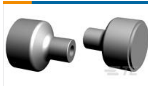
TE Part #85024-1 RUBBER PLUG GRAY FOR 187 SEALD