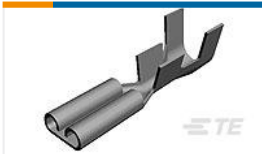
TE Part #41274-1 250 FASTON,REC.,18-14 AWG,TPBR