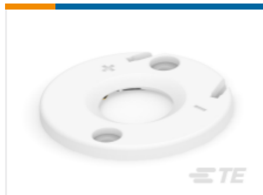
TE Part #2325807-2 LUMAWISE Z45 LED HOLDER 19X19