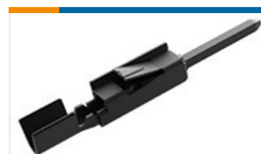
TE Part #1740335-1 MICRO QUADLOK SYSTEM PIN CONTA