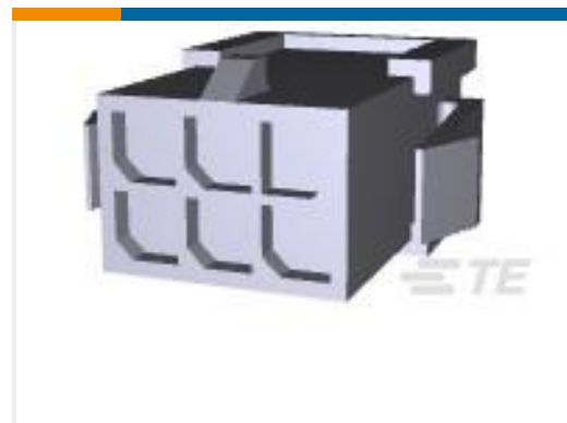
TE Part #794615-6 PANEL MT DBL ROW HSG 6 POS