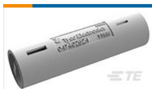
TE Part #1740262-1 NECTOR S OUTLET HV-1 WHITE