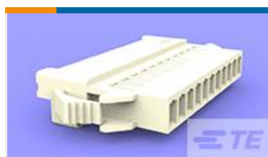
TE Part #1969590-4 HSG, REC, PANEL MOUNT, SINGLE ROW, EP2.5