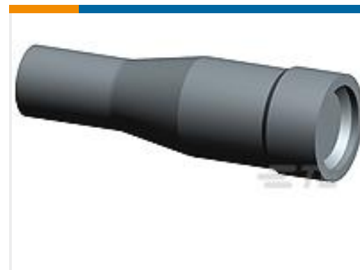
TE Part #293284-1 NECTOR S BUS BAR BOOT