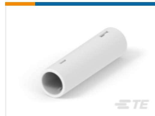
TE Part #293387-2 NECTOR S OUTLET HV-4 WHITE