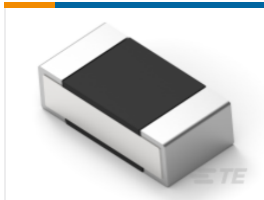
TE Part #7-2176305-4 RP 1E 0.1W 619R 0.1% 25PPM 5K RL