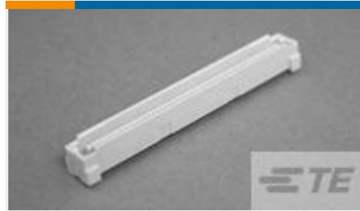
TE Part # 5179029-1 0.8FH,P06H.5,040,08/Sn,TU