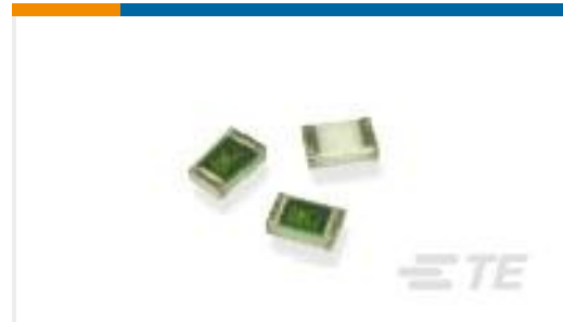
TE Part #6-2176089-7 RP 1J 0.166W 56K2 0.1% 25PPM 1K RL