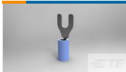
TE Part #325199 TERMINAL,PIDG SPD 16-14 8