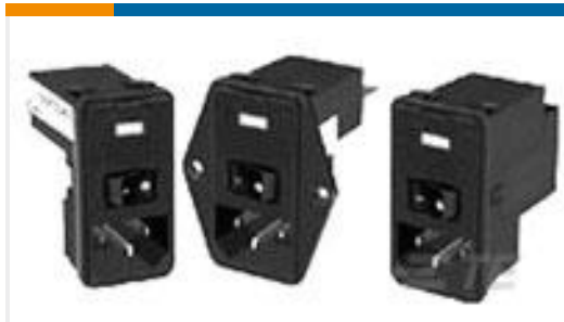
TE Part #6-6609107-1 PS000SSXB=C1120