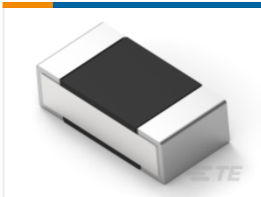
TE Part #6-2176307-3 RP 1E 0.1W 54K9 0.1% 25PPM 5K RL