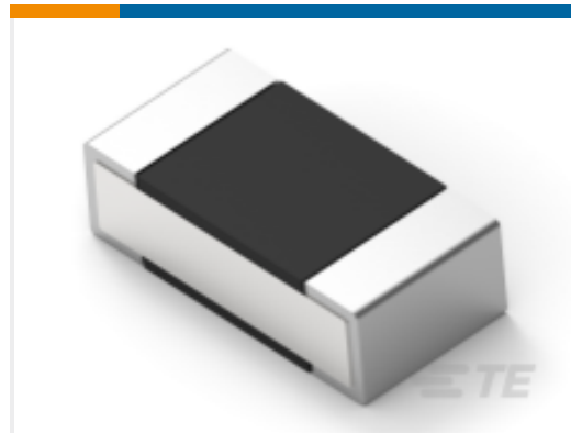
TE Part #6-2176307-8 RP 1E 0.1W 61K9 0.1% 25PPM 5K RL