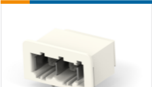
TE Part #2305987-2 2-PORT MATENET HDR ASSY 90DEG, COD B