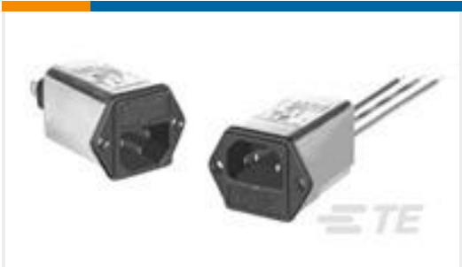
TE Part #6609117-6 6EGS1-2=F7860 S0