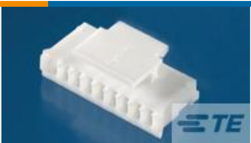
TE Part # 1735447-8 HPI 2.0 RECEPTACLE HOUSING, 8P