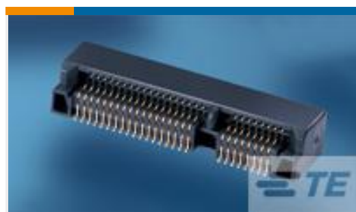
TE Part #1775838-2 mSATA/mini PCI-E 5.6H Type I G/F