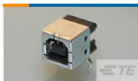
TE Part #292304-1 STD USB TYPE B, R/A, T/H