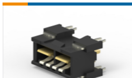
TE Part #2042274-6 ELCON MINI 2P VERT HEADER,PRESS- FIT,W/O