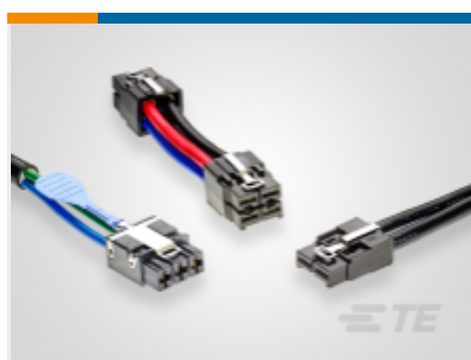
TE Part #2304883-1 CA,ET, 2POS, SHORT PULL-TAB,NO DETECT