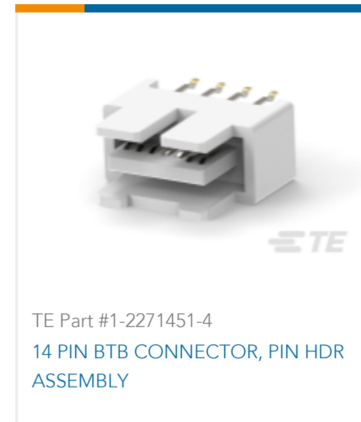
TE Part #1-2271451-4 14 PIN BTB CONNECTOR, PIN HDR ASSEMBLY