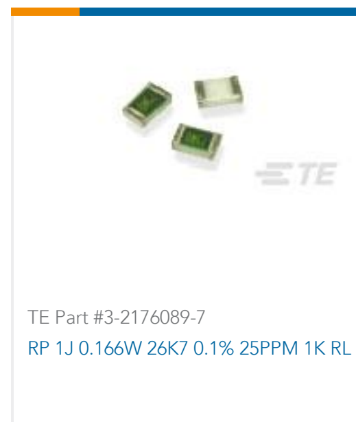
TE Part #3-2176089-7 RP 1J 0.166W 26K7 0.1% 25PPM 1K RL