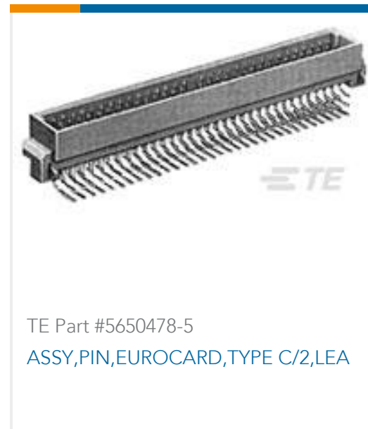
TE Part #5650478-5 ASSY,PIN,EUROCARD,TYPE C/2,LEA