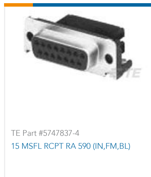
TE Part #5747837-4 15 MSFL RCPT RA 590 (IN,FM,BL)