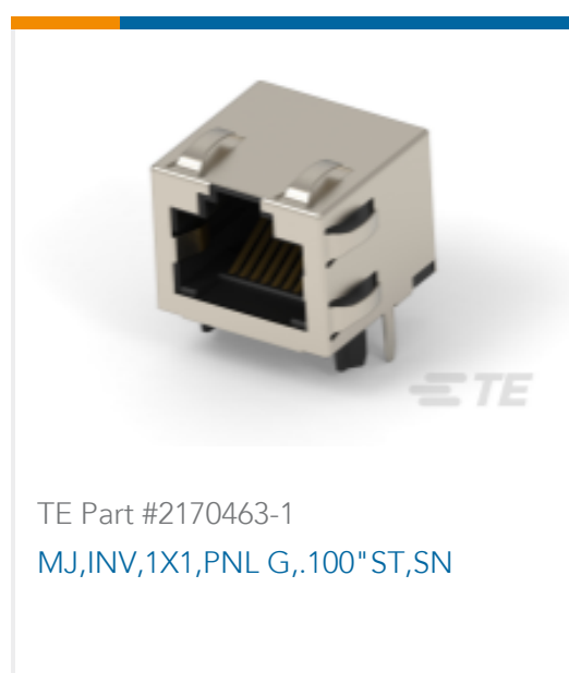
TE Part #2170463-1 MJ,INV,1X1,PNL G,.100"ST,SN"