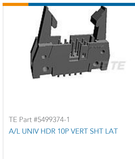
TE Part #5499374-1 A/L UNIV HDR 10P VERT SHT LAT