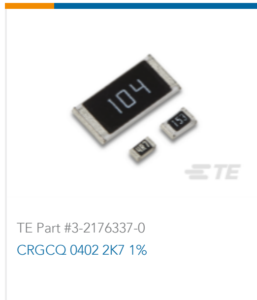
TE Part #3-2176337-0 CRGCQ 0402 2K7 1%