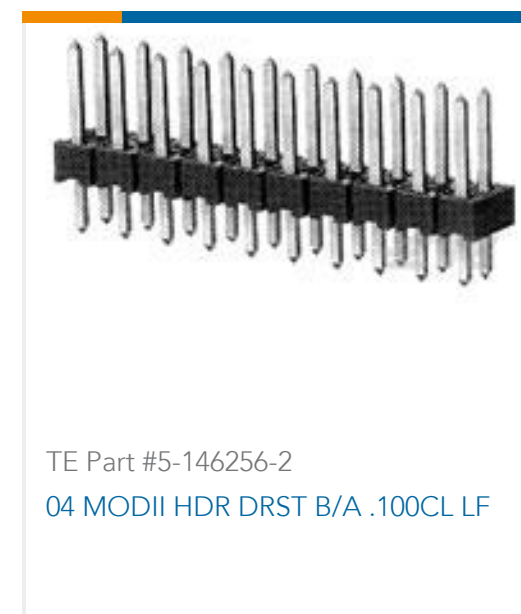
TE Part #5-146256-2 04 MODII HDR DRST B/A .100CL LF