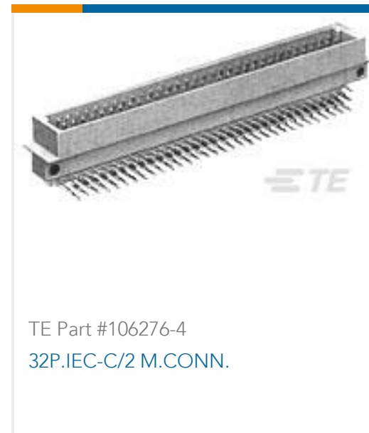
TE Part #106276-4 32P.IEC-C/2 M.CONN.