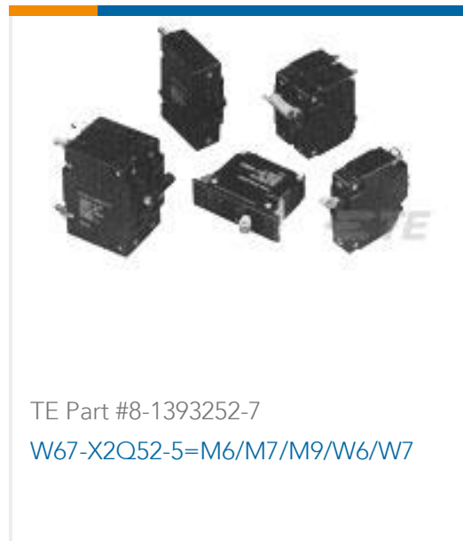
TE Part #8-1393252-7 W67-X2Q52-5=M6/M7/M9/W6/W7