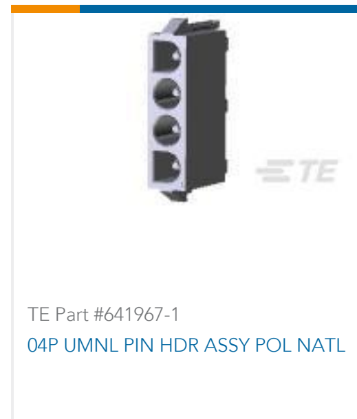
TE Part #641967-1 04P UMNL PIN HDR ASSY POL NATL