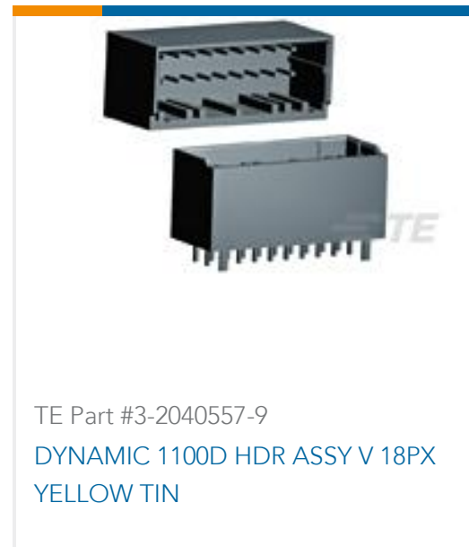
TE Part #3-2040557-9 DYNAMIC 1100D HDR ASSY V 18PX YELLOW TIN