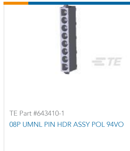
TE Part #643410-1 08P UMNL PIN HDR ASSY POL 94VO