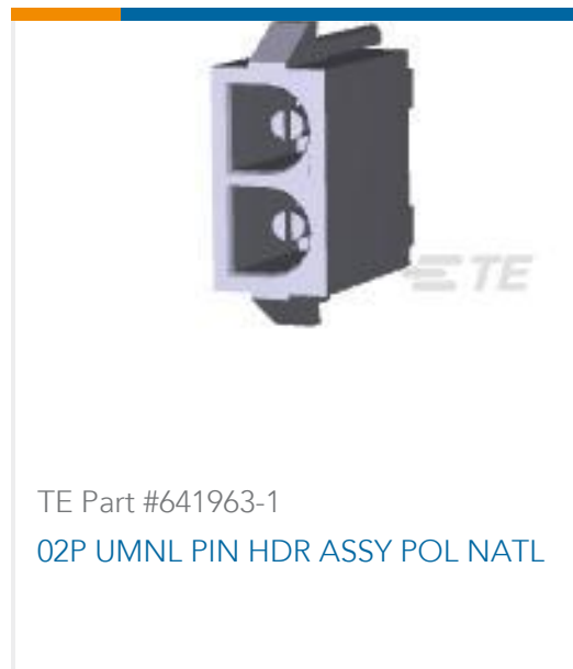
TE Part #641963-1 02P UMNL PIN HDR ASSY POL NATL