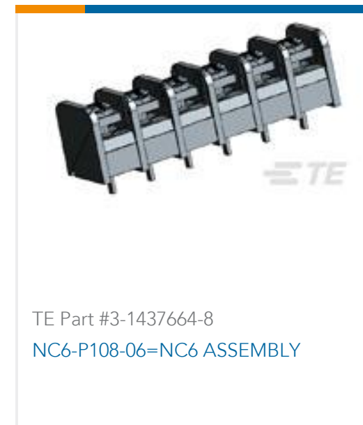
TE Part #3-1437664-8 NC6-P108-06=NC6 ASSEMBLY