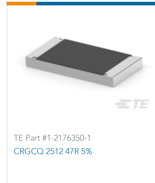
TE Part #1-2176350-1 CRGCQ 2512 47R 5%