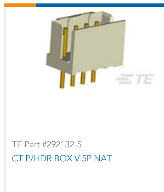
TE Part #292132-5 CT P/HDR BOX V 5P NAT