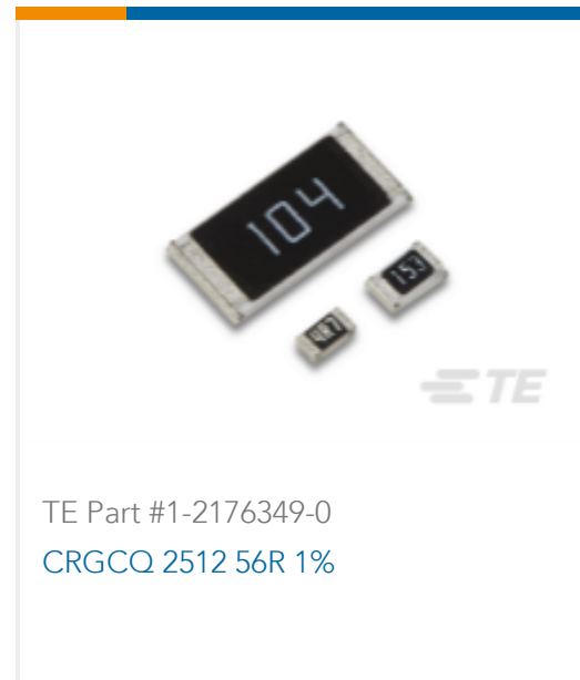
TE Part #1-2176349-0 CRGCQ 2512 56R 1%