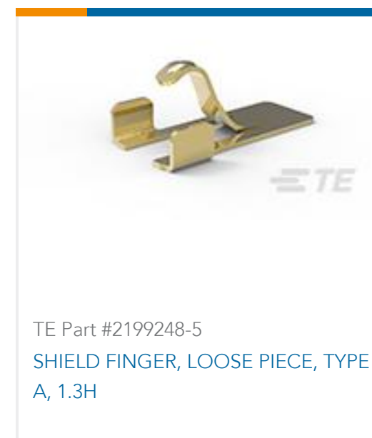
TE Part #2199248-5 SHIELD FINGER, LOOSE PIECE, TYPE A, 1.3H