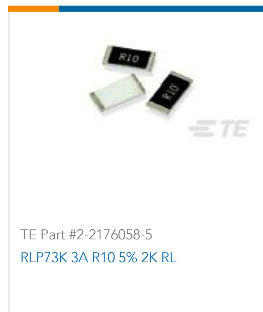
TE Part #2-2176058-5 RLP73K 3A R10 5% 2K RL