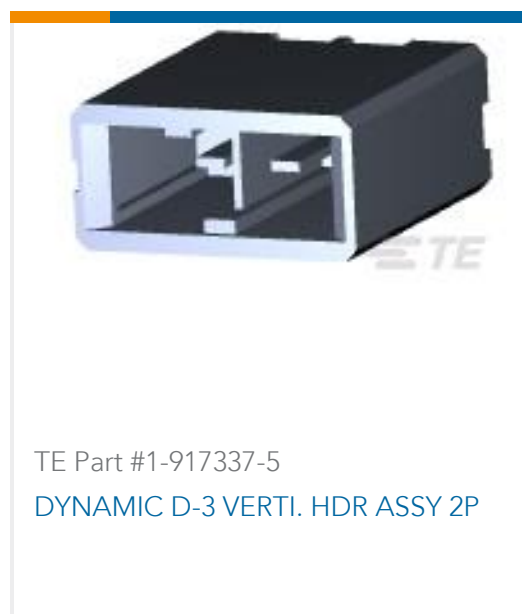
TE Part #1-917337-5 DYNAMIC D-3 VERTI. HDR ASSY 2P