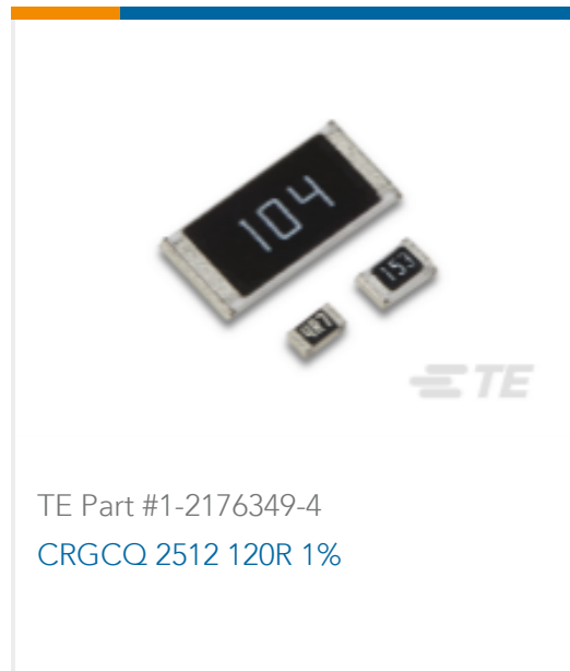
TE Part #1-2176349-4 CRGCQ 2512 120R 1%