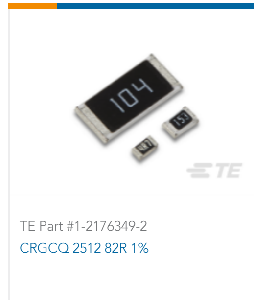
TE Part #1-2176349-2 CRGCQ 2512 82R 1%