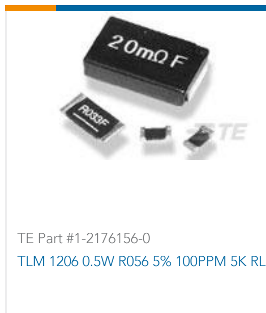
TE Part #1-2176156-0 TLM 1206 0.5W R056 5% 100PPM 5K RL