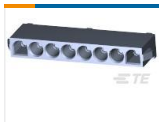
TE Part #826851-3 8P UN-MNL BU SOCK