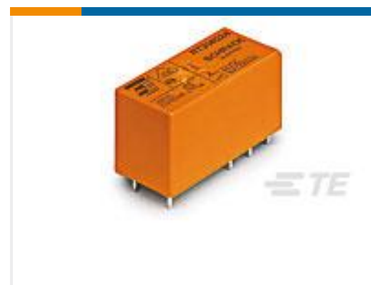
TE Part #2-1393237-8 RT424012F