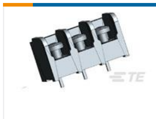
TE Part #6-1437657-9 8PCV-03-006=#8 TRIBARRIER