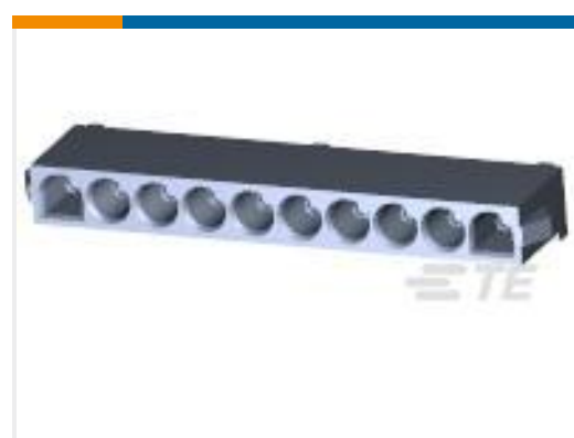
TE Part #826852-3 10P UN-MNL BU SOCK