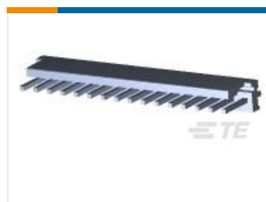
TE Part #1-640445-6 16P MTA156 HDR ASSY FL/STR SN