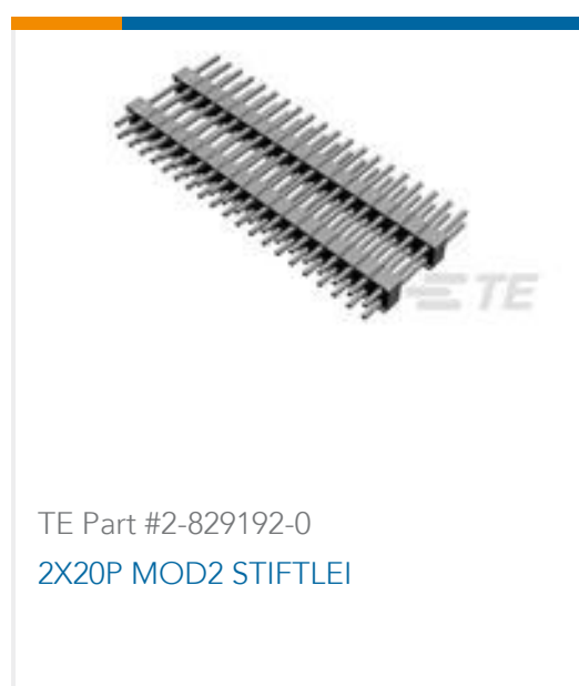
TE Part #2-829192-0 2X20P MOD2 STIFTLEI