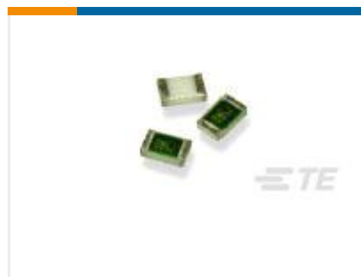
TE Part #2-1879208-6 CPF 0402 110R 0.1% 25PPM 1K RL