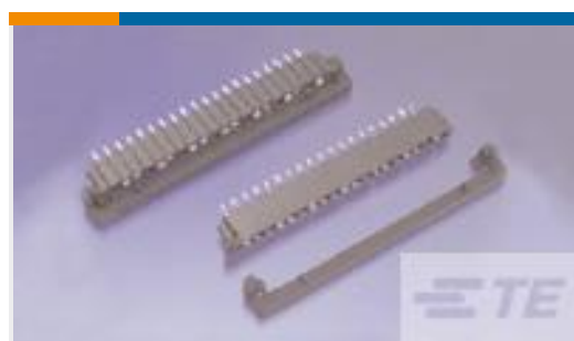
TE Part # 5-120628-8 LOCKING TRIOMATE ASY 8P(L)LDFR