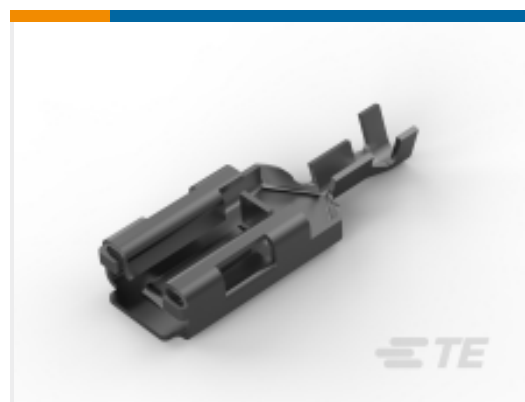
TE Part # 170452-2 PL 250 AUTOMOTIVE REC 22-20 AWG PRE TPBR