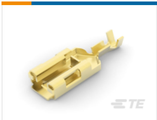
TE Part # 170452-1 PL 250 AM REC 22-20 AWG 0.406 X 21 BR