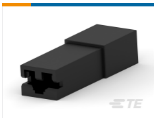
TE Part # 1969877-1 187 HIGH TEMP POS LOCK HSG LCP