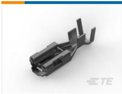
TE Part # 170456-2 PL 250 AM REC 12-10 0.40 X 21 PRE-TPBR