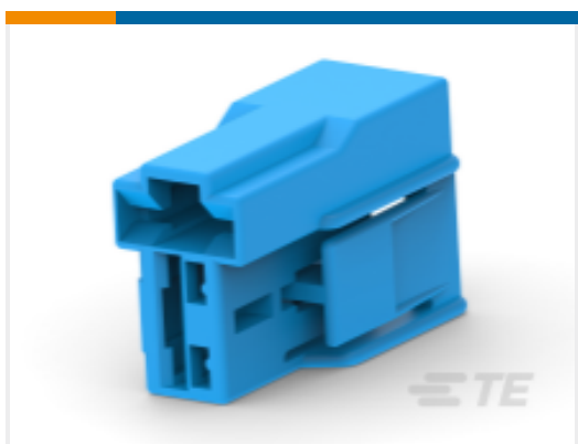
TE Part # 172434-6 250 P.LOCK 2P HSG T-TYPE BLUE