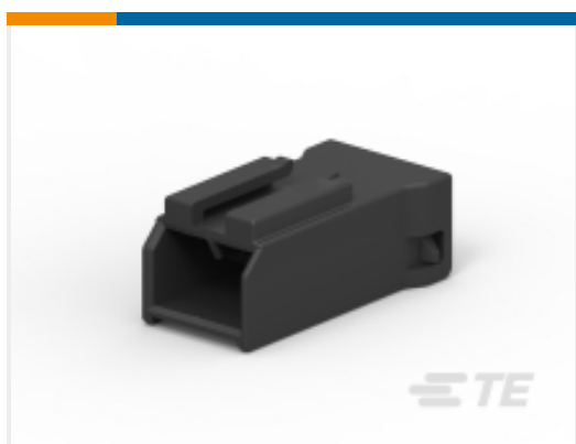
TE Part # 2219340-2 GLASS ANT 250 1P CAP HSG