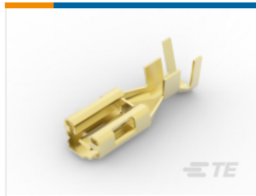
TE Part # 170456-1 PL 250 AUTOMOTIVE REC 12-10 0.40 X 21 BR