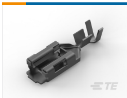
TE Part # 170454-2 PL 250 AM REC 18-14 0.40 X 21 PRE-TPBR