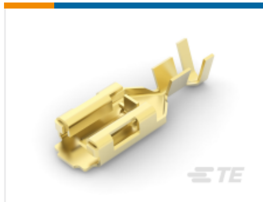
TE Part # 170454-1 PL 250 AUTOMOTIVE REC 18-14 0.40 X 21 BR