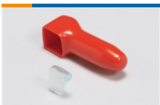
Insulation Boots & Sleeves(4)