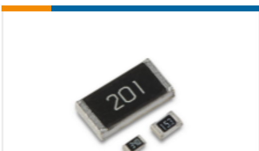
TE Part #2176328-5 CRGP 1206 22R 1%