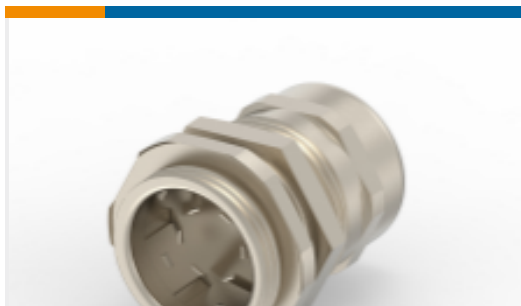
TE Part #1478884-4 METRIC EMC GLAND M25X1.5