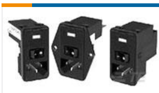
TE Part #6-6609107-3 PS000SS3B=C1122