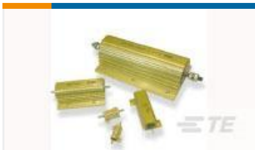
TE Part #1-1630027-1 HSC300 330R 5%