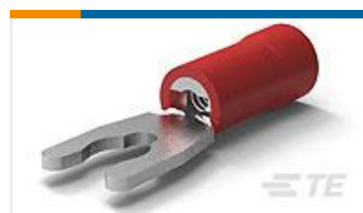
TE Part #52949-1 PG SPR SPD 22-16COMM 22-18MIL6