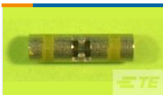
TE Part #680329-000 D-609-09