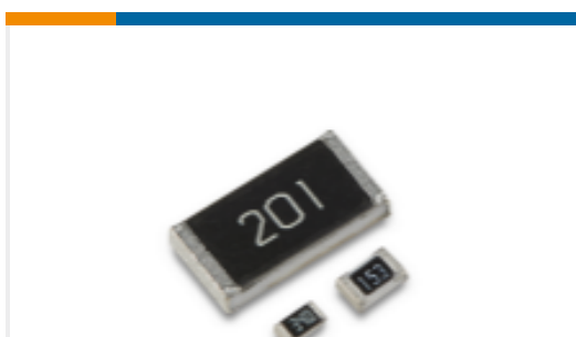
TE Part #2-2176328-5 CRGP 1206 1K0 1%