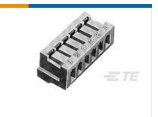
TE Part #172142-4 EIS LOW PROFILE HSG 4P NATURAL