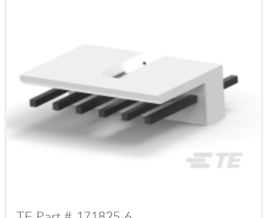
TE Part # 171825-6 POST HDR ASSY VERT AMP EI CONN