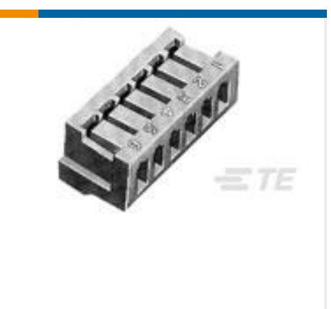
TE Part #172142-7 EIS LOW PROFILE HSG 7P NATURAL