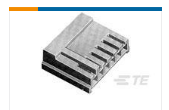
TE Part #171822-2 EIS REC. HSG 2P-NATURAL