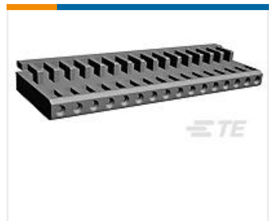
TE Part #926475-4 MOD 4 HSG