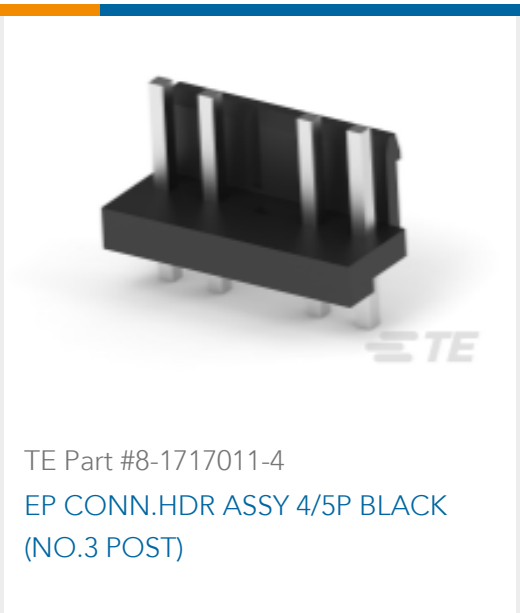
TE Part #8-1717011-4 EP CONN.HDR ASSY 4/5P BLACK (NO.3 POST)