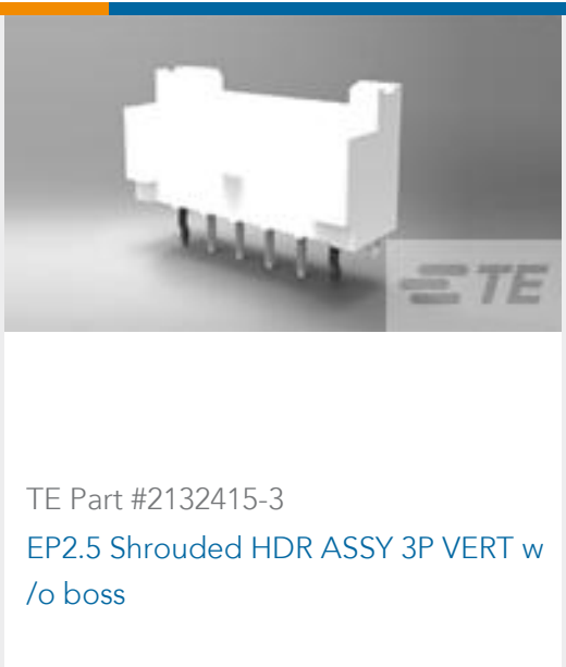
TE Part #2132415-3 EP2.5 Shrouded HDR ASSY 3P VERT w /o boss