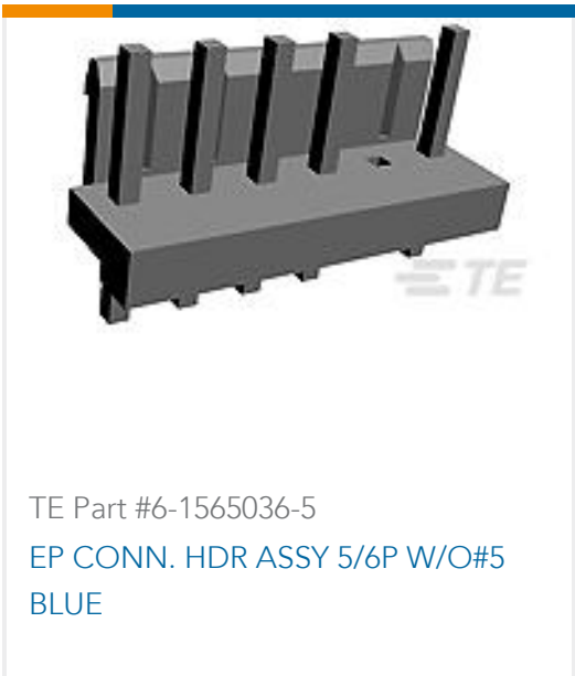
TE Part #6-1565036-5 EP CONN. HDR ASSY 5/6P W/O#5 BLUE