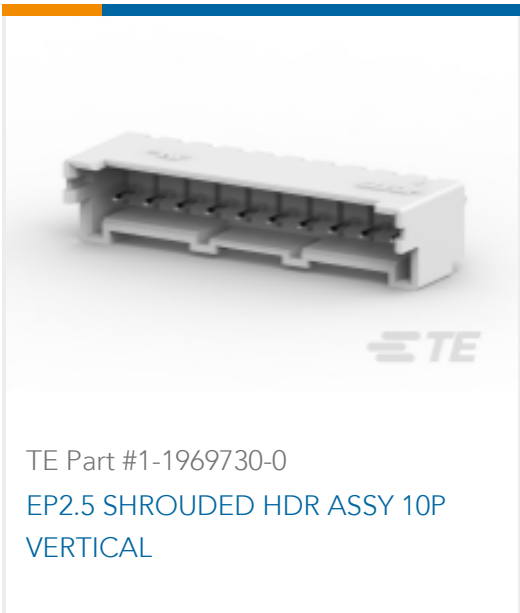
TE Part #1-1969730-0 EP2.5 SHROUDED HDR ASSY 10P VERTICAL