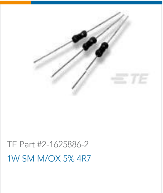
TE Part #2-1625886-2 1W SM M/OX 5% 4R7