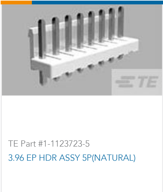
TE Part #1-1123723-5 3.96 EP HDR ASSY 5P(NATURAL)