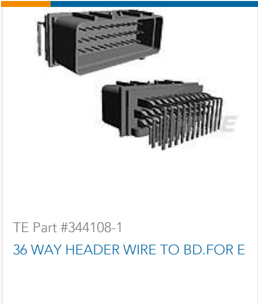
TE Part #344108-1 36 WAY HEADER WIRE TO BD.FOR E