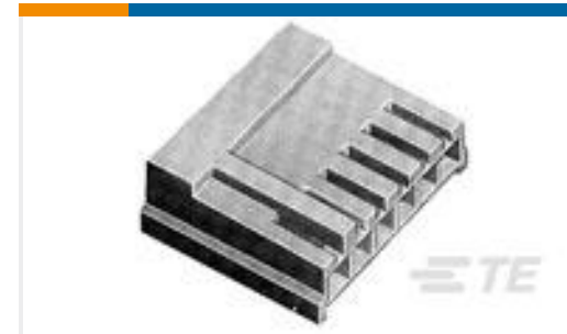
TE Part #171822-2 EIS REC. HSG 2P-NATURAL