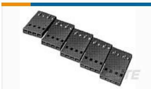
TE Part #104503-2 03 MTE PIN HSG SR RIB .100CL