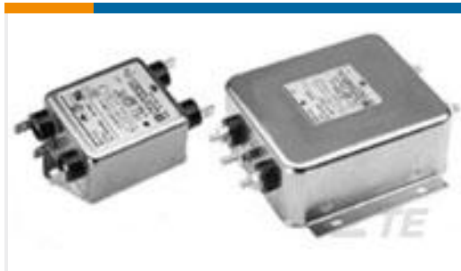
TE Part #6609044-4 20VW1=F7257 S0