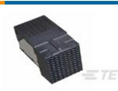
TE Part #1934222-1 Tin Man Recept Assy 4Pair8Column