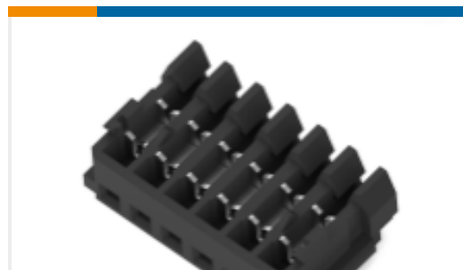
TE Part #2-353293-6 1.5MM CT MT REC ASS'Y 6P BLACK