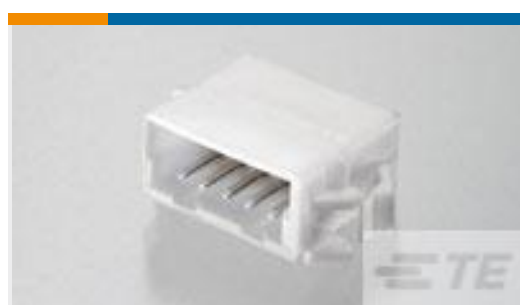
TE Part #2-292254-3 CT RELAY HDR ASSY 3P BLUE