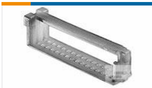
TE Part #2-353294-4 AMP MINI D/R HDR HSG 24P NATU