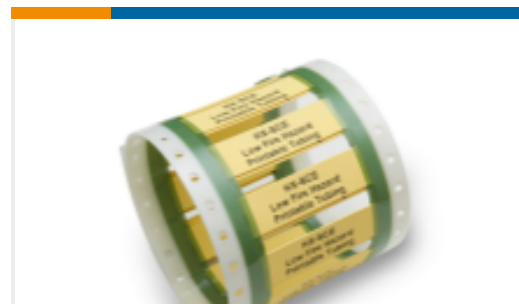
TE Part #E14886-000 HX-SCE Low Fire Hazard Sleeves