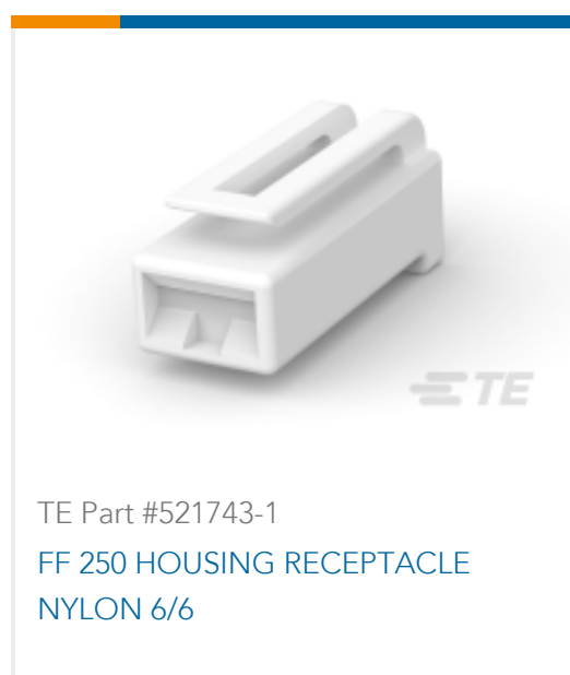
TE Part #521743-1 FF 250 HOUSING RECEPTACLE NYLON 6/6