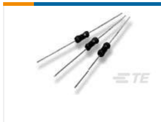
TE Part #2-1625885-6 1W SM M/OX 5% 180K