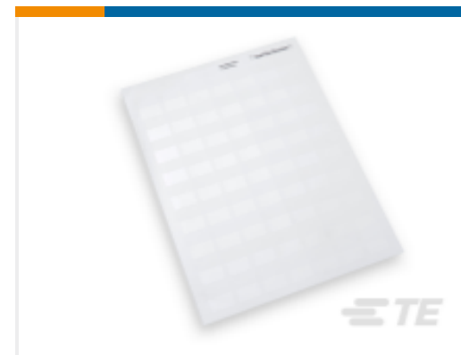
TE Part #9-1768016-1 CSL Self Laminating Polyester Labels