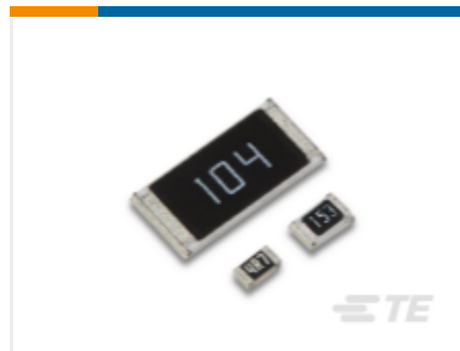
TE Part #3-2176341-4 CRGCQ 0805 5K6 1%