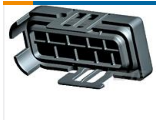
TE Part #2112297-1 PROTECTION CAP,GROUP E,ASSY