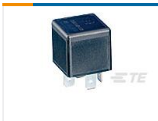
TE Part #1-1393303-0 V23134B0053G242-EV-CBOX