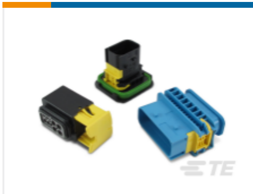
TE Part #1-1418390-1 Heavy Duty Sealed Connector Series Housings