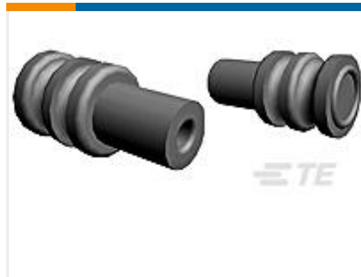
TE Part #964972-1 EINZELLEITERDICHTNG