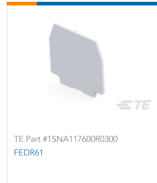
TE Part #1SNA117600R0300 FEDR61