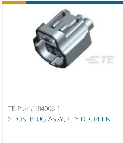
TE Part #184006-1 2 POS. PLUG ASSY, KEY D, GREEN