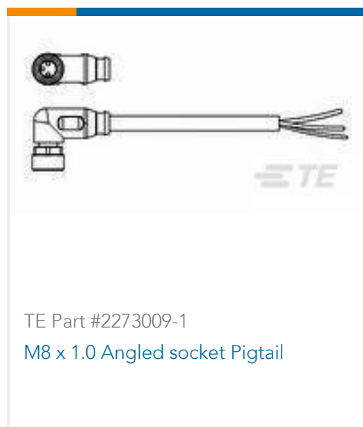
TE Part #2273009-1 M8 x 1.0 Angled socket Pigtail