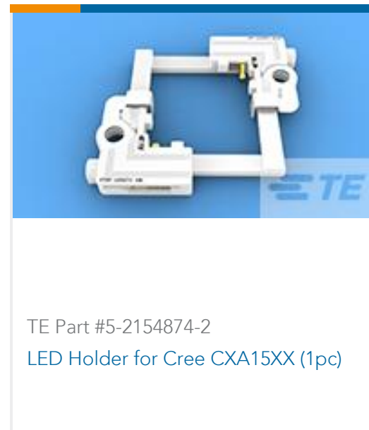
TE Part #5-2154874-2 LED Holder for Cree CXA15XX (1pc)