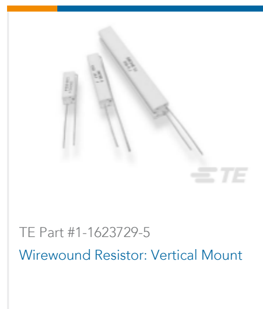
TE Part #1-1623729-5 Wirewound Resistor: Vertical Mount