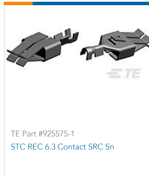
TE Part #925575-1 STC REC 6.3 Contact SRC Sn