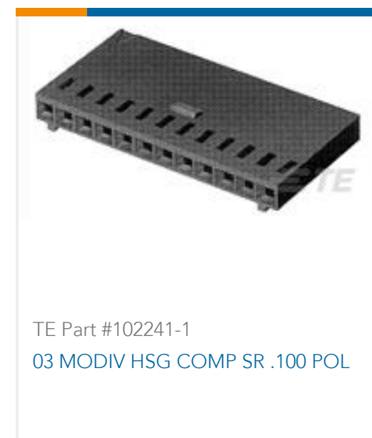
TE Part #102241-1 03 MODIV HSG COMP SR .100 POL