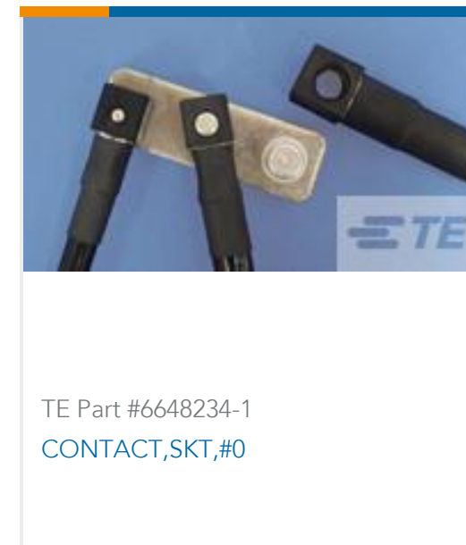
TE Part #6648234-1 CONTACT,SKT,#0