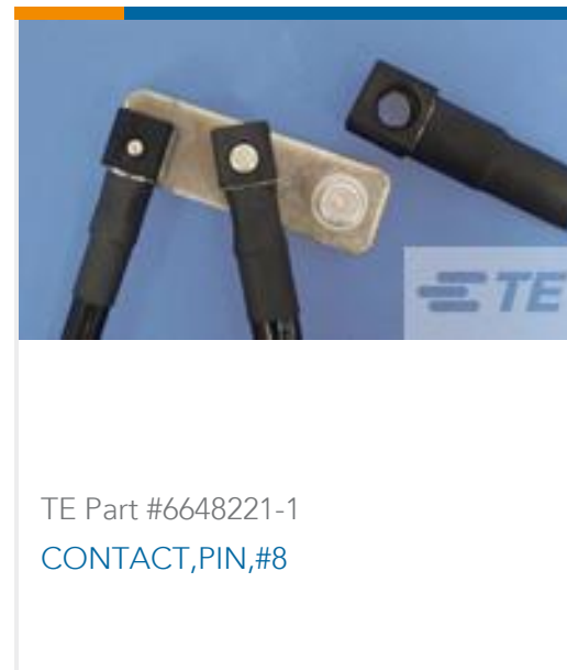
TE Part #6648221-1 CONTACT,PIN,#8