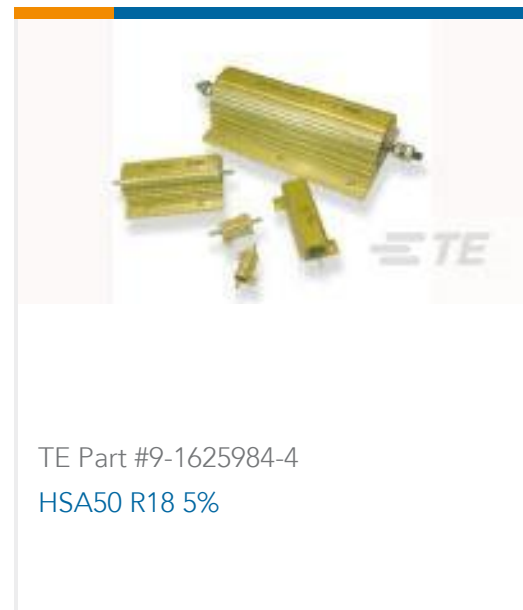
TE Part #9-1625984-4 HSA50 R18 5%