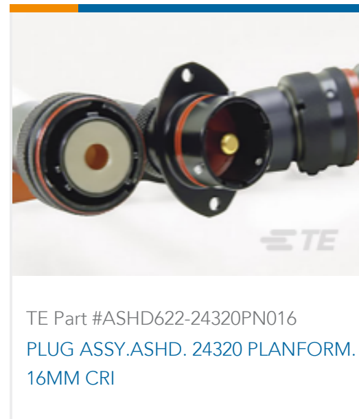
TE Part #ASHD622-24320PN016 PLUG ASSY.ASHD. 24320 PLANFORM. 16MM CRI