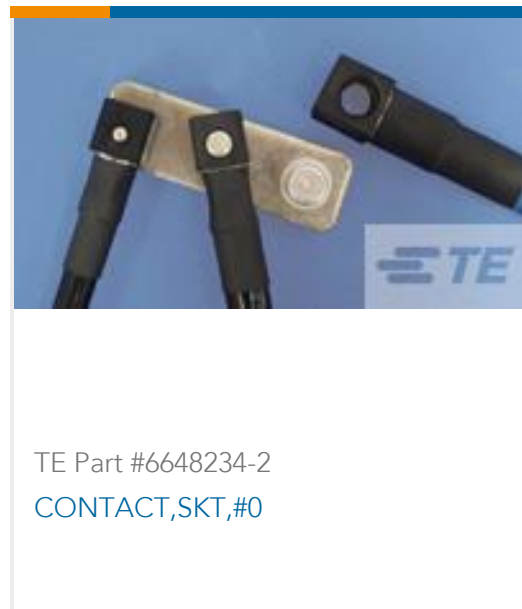
TE Part #6648234-2 CONTACT,SKT,#0