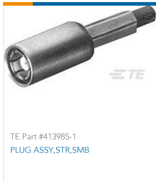
TE Part #413985-1 PLUG ASSY,STR,SMB