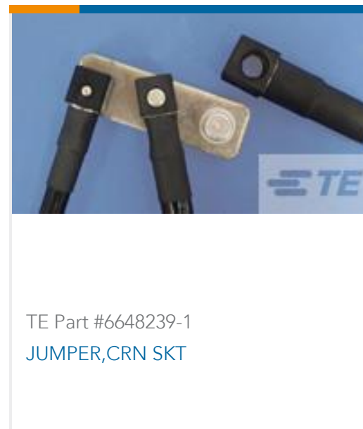
TE Part #6648239-1 JUMPER,CRN SKT