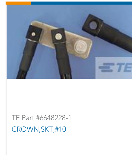
TE Part #6648228-1 CROWN,SKT,#10