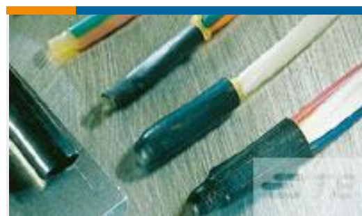
TE Part #EG41020001 ES-CAP-NO.2-B9-0-30MM