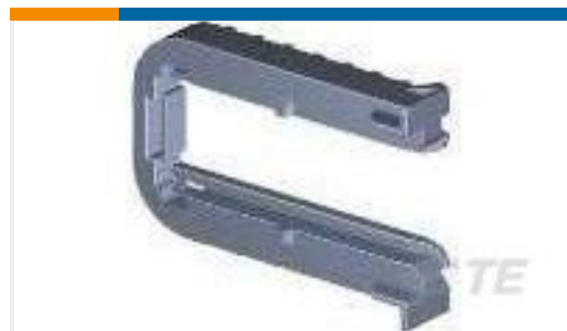
TE Part #1564411-5 SLIDE,TAB HSG GROUP E