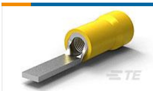
TE Part #131445 PG, WIRE TAB, 12-10