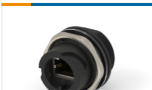
TE Part #2355443-2 RJ45 CAT5e PANEL MOUNT SOCKET (PBT)