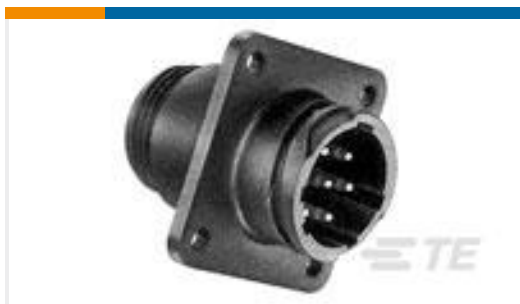
TE Part #211771-1 23-19 CPC RECEPT, STND SEX