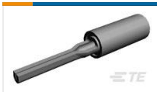
TE Part #165514-1 TERM, WIRE PIN, PIDG, 26-22