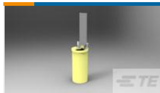
TE Part #324543 TAB,PIDG 12-10