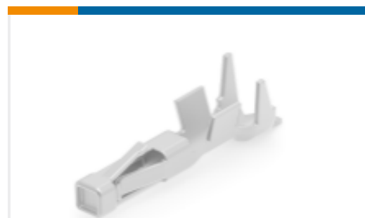
TE Part #1-2834067-2 SOCKET CONTACT,MINIATURE WATERPROOF CONN