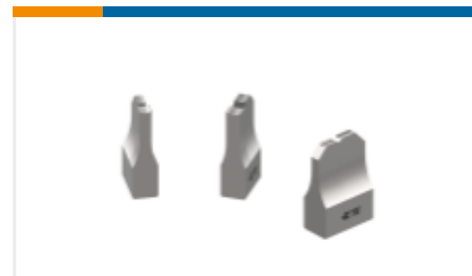
ANVIL REPRESENTATION ONLY