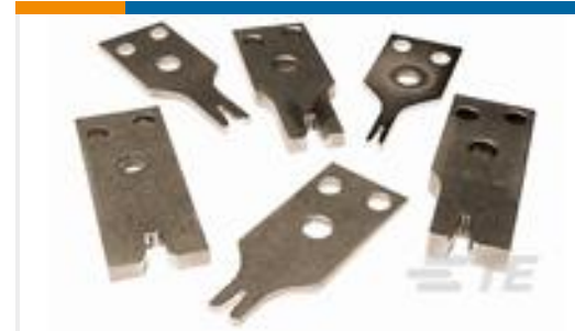
TE Part #2-1490019-3 CRIMPER, WIRE (.050" 'F')