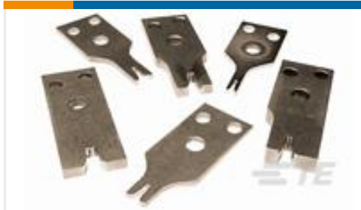
TE Part #2-1333281-7 CRIMPER, WIRE, F PREMIUM (.042")