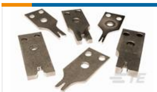
TE Part #3-456402-3 CRIMP, WIRE (.055F X 135THK)