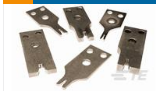
TE Part #2-1633860-1 CRIMPER, WIRE F