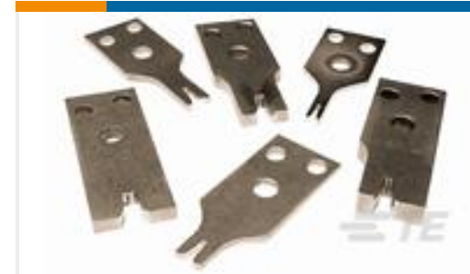
TE Part #3-1633730-2 CRIMPER, WIRE F .055F