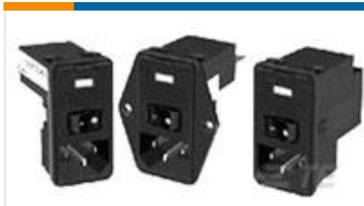
TE Part #6609107-6 PS0SXDS30=C1031