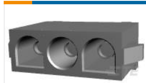
TE Part #350832-1 03P UMNL HDR ASSY PC 94VO