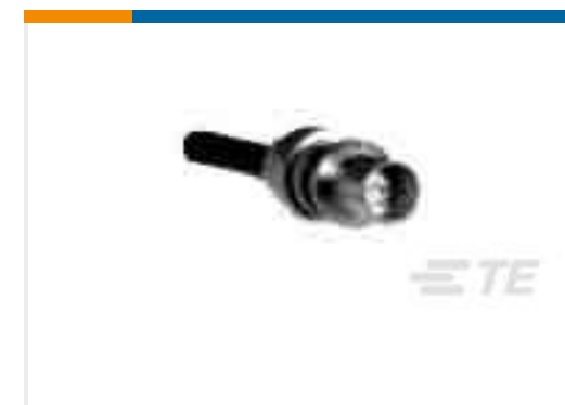
TE Part #1108616-1 KX.Sti.3,0/7,3/10,8