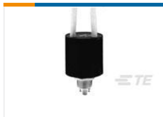
TE Part #6-1618404-0 K62A971=Relay, Vacuum, SPST NO