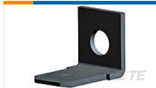
TE Part #181953-1 250 FASTON,TAB,BR