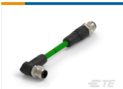
TE Part #TAD14841111-150 M12D4-MS-MR-PVC TYPE B-15.0M