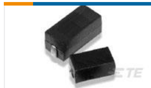
TE Part #2-1879022-7 SMF3 3K9 5%