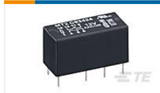
TE Part #1462000-1 C93401=MT RELAY 150 MW 5 V