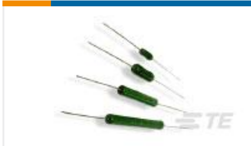
TE Part #2-1623773-8 C10 4K7 5% (LOOSE)