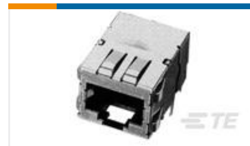
TE Part #2-5338556-1 8/8 MOD JACK ASSY SE