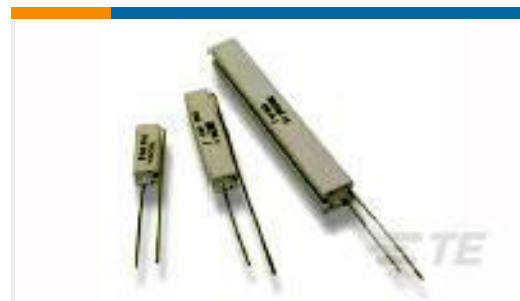
TE Part #2-1623728-2 BCHE 11 W 47R 5%