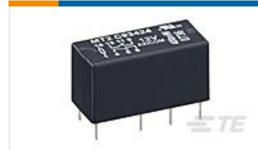
TE Part #3-1462000-7 C93418=MT Relay 200 mW 12 V