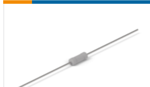
TE Part #8-1676123-5 1/2W SM M/OX 5% 2K7