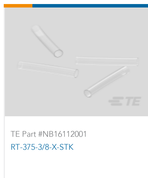
TE Part #NB16112001 RT-375-3/8-X-STK