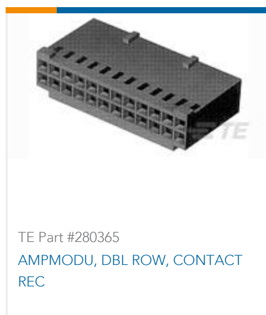
TE Part #280365 AMPMODU, DBL ROW, CONTACT REC