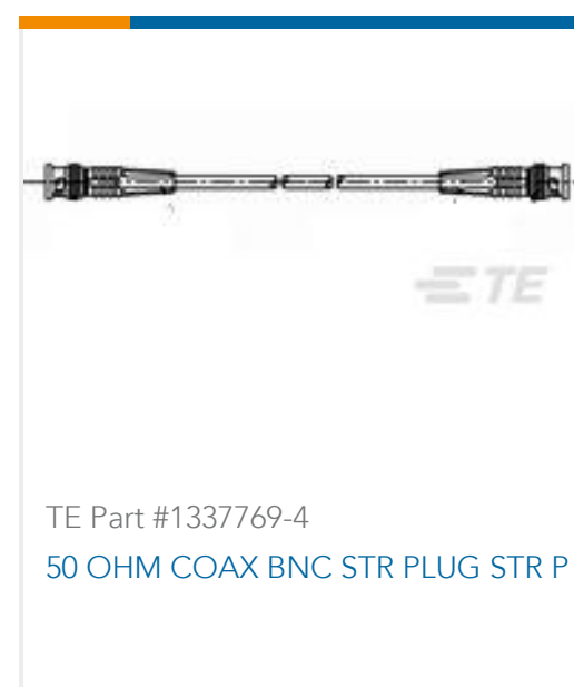
TE Part #1337769-4 50 OHM COAX BNC STR PLUG STR P