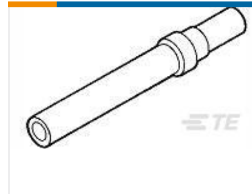
TE Part #205090-1 HD 20 SOCKET CONTACT