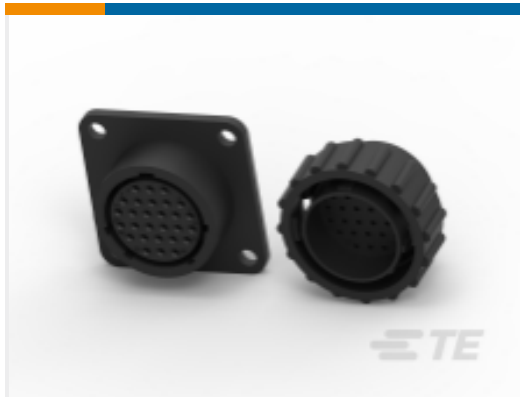
TE Part #206433-2 CPC Connectors, Series 2