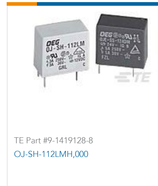
TE Part #9-1419128-8 OJ-SH-112LMH,000