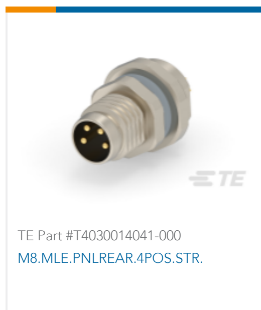
TE Part #T4030014041-000 M8.MLE.PNLREAR.4POS.STR.