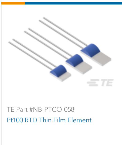
TE Part #NB-PTCO-058 Pt100 RTD Thin Film Element