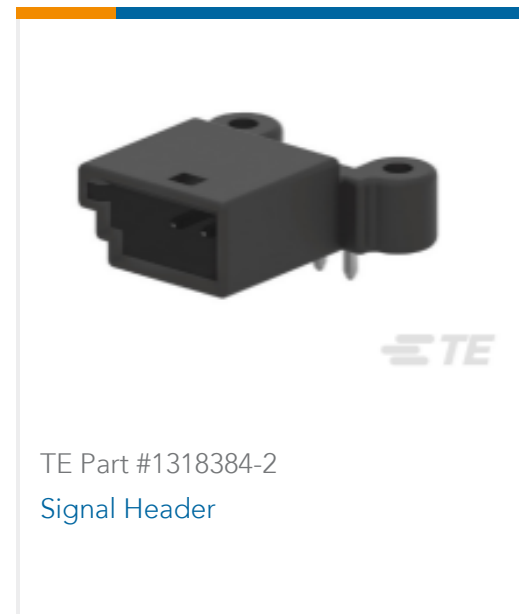
TE Part #1318384-2 Signal Header