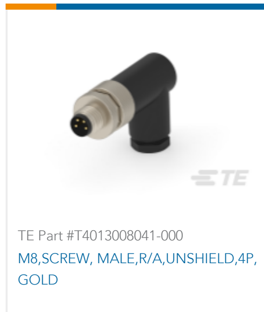
TE Part #T4013008041-000 M8,SCREW, MALE,R/A,UNSHIELD,4P, GOLD