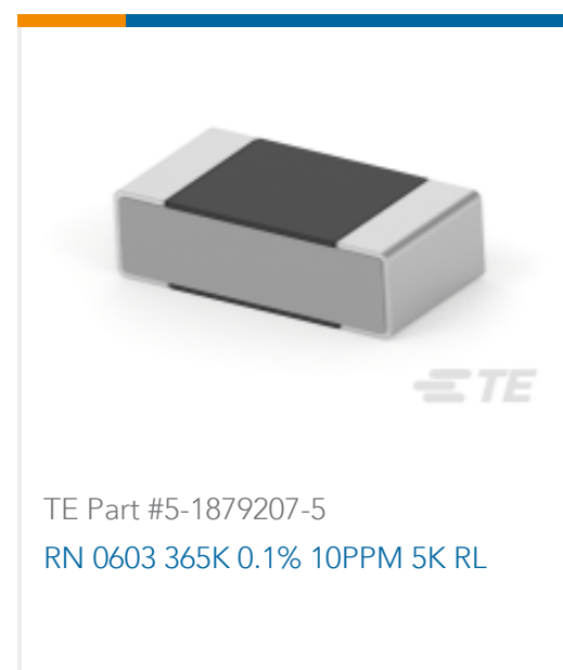
TE Part #5-1879207-5 RN 0603 365K 0.1% 10PPM 5K RL