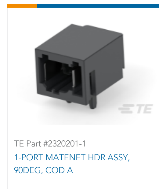
TE Part #2320201-1 1-PORT MATENET HDR ASSY, 90DEG, COD A