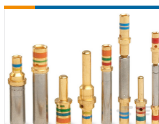
TE Part #100503L CONT SOC ASSY