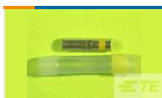
TE Part #650076-000 D-436-38