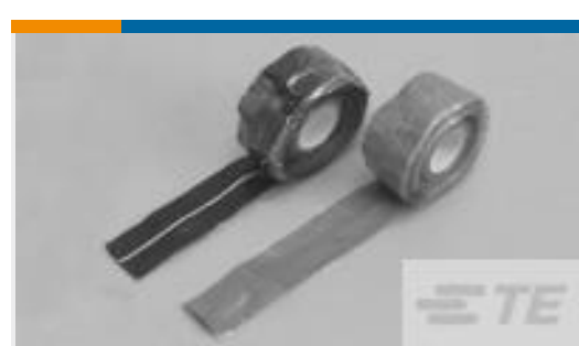
TE Part #1-608036-4 SILICONE FUSION TAPE,1"X15'