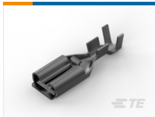
TE Part # 175022-1 250 PL EX REC. 18-14AWG PTBR