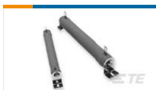
TE Part #2-1879453-7 TE 1000W 150R 5% Bracket