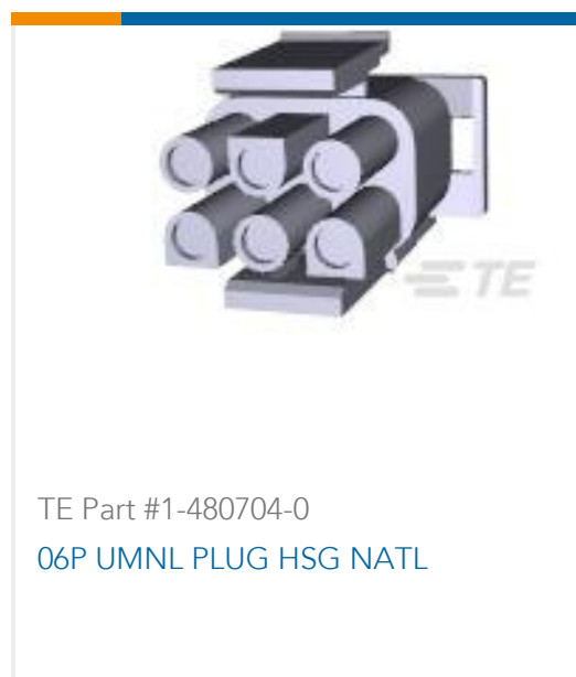
TE Part #1-480704-0 06P UMNL PLUG HSG NATL