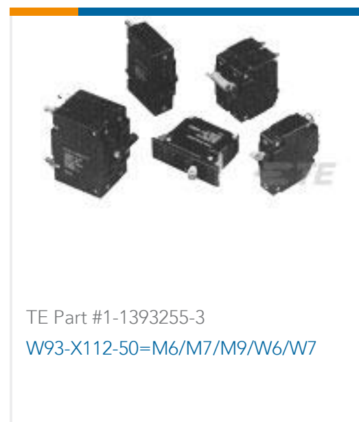
TE Part #1-1393255-3 W93-X112-50=M6/M7/M9/W6/W7