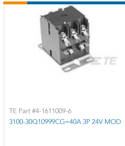
TE Part #4-1611009-6 3100-30Q10999CG=40A 3P 24V MOD