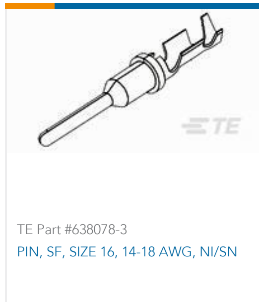
TE Part #638078-3 PIN, SF, SIZE 16, 14-18 AWG, NI/SN