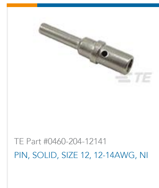
TE Part #0460-204-12141 PIN, SOLID, SIZE 12, 12-14AWG, NI