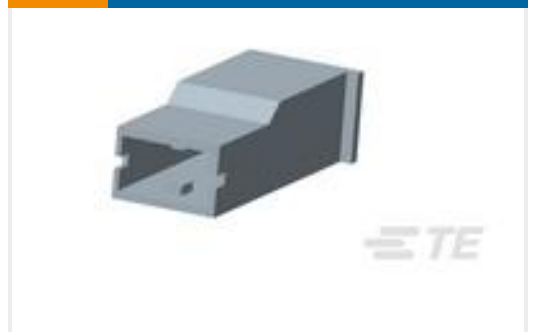
TE Part #154719-2 PL 250 REC HSG 1P NYLON RED