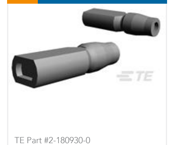
250 FASTON HSG.,REC.,1 POS, NATRUAL