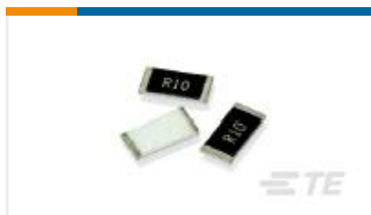
TE Part #4-2176058-9 RLP73K 3A 1R0 5% 2K RL