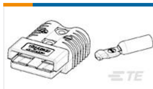
TE Part #1604044-4 KIT,175A, 4 AWG,GRAY