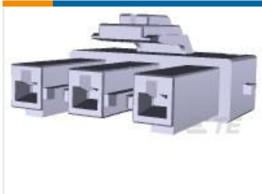
TE Part #179938-1 AMP POWER DBL LOCK PLUG HSG 3P