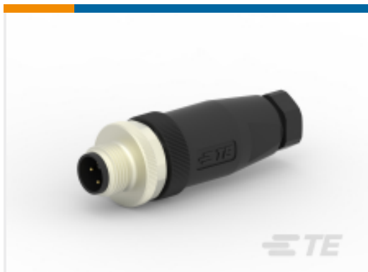
TE Part #T4111001041-000 RPC-M12-MS-4CON-PG7-MU