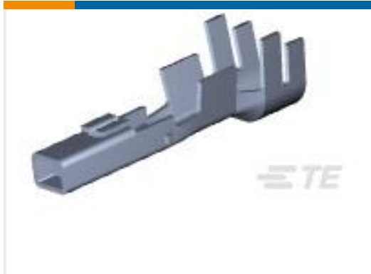
TE Part #177915-2 AMP POWER DBL LOCK REC