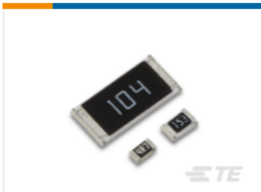
TE Part #1-2176343-9 CRGCO 1206 330R 1%