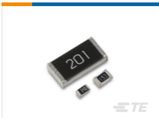
TE Part #3-2176328-1 CRGP 1206 3K3 1%