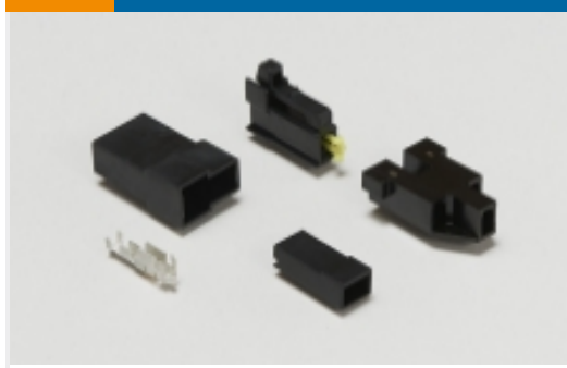
Magnet Wire Terminals(196)