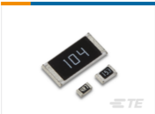
TE Part #2-2176343-9 CRGCO 1206 2K2 1%