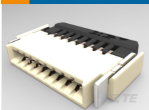
TE Part #2328702-6 6PIN 0.5MMP FPC CONNECTOR, BACK FLIP LOCK