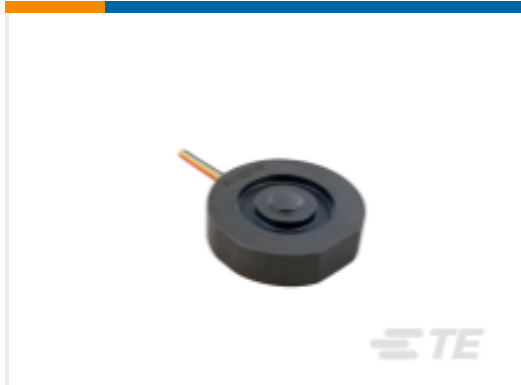
TE Part #20009605-16 FX29K0-040B-0010-L