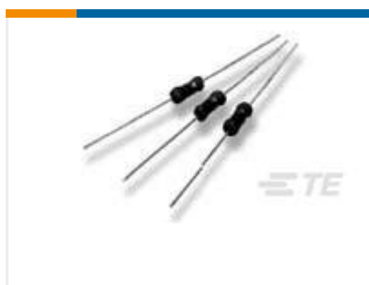
TE Part #4-1625892-3 3W SM M/OX 5% 33R