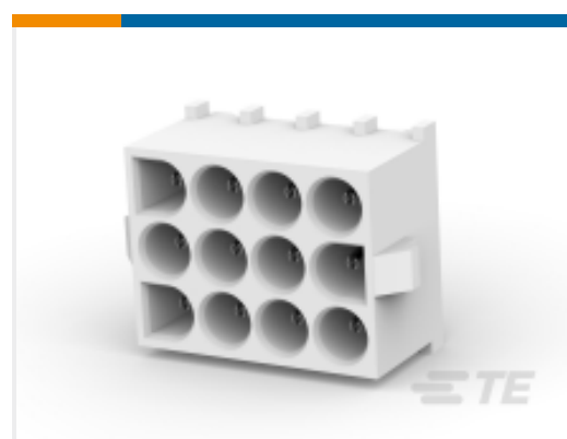
TE Part #1586176-1 12P UMNL PIN HDR 94VO NDH