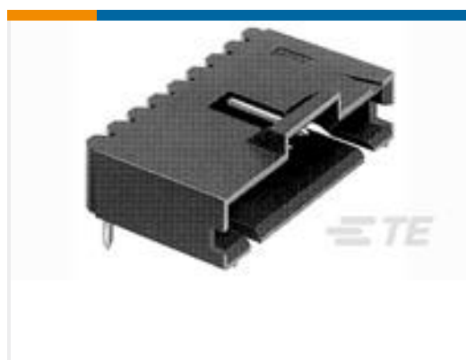
TE Part #5-103634-8 09 MTE HDR SRRA LATCH.100CL LF