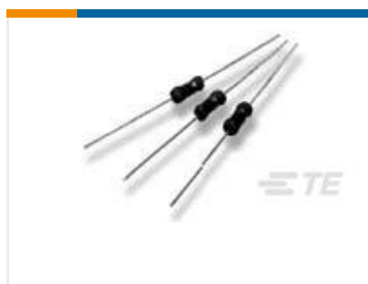
TE Part #5-1625892-5 3W SM M/OX 5% 4K7