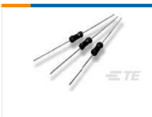
TE Part #1-1625892-8 3W SM M/OX 5% 180K