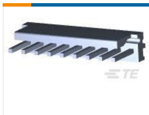
TE Part #640445-9 09P MTA156 HDR ASSY FL/STR SN