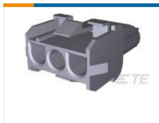
TE Part #1-480701-6 03P UMNL CAP HSG BLU