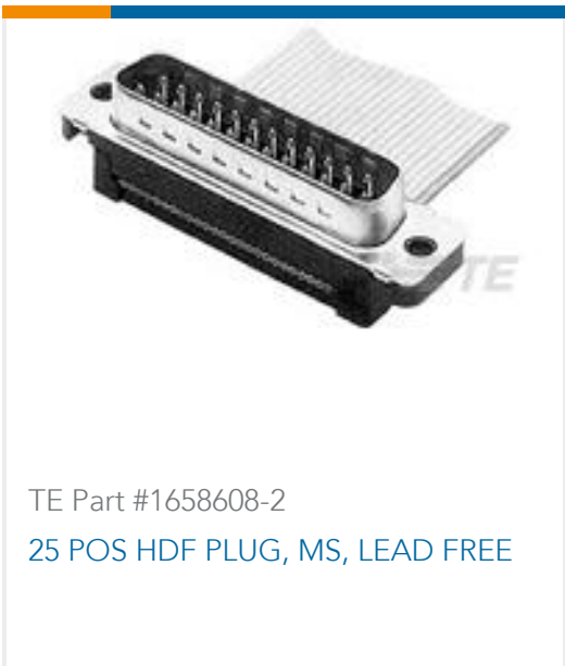
TE Part #1658608-2 25 POS HDF PLUG, MS, LEAD FREE