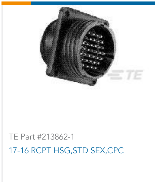
TE Part #213862-1 17-16 RCPT HSG,STD SEX,CPC