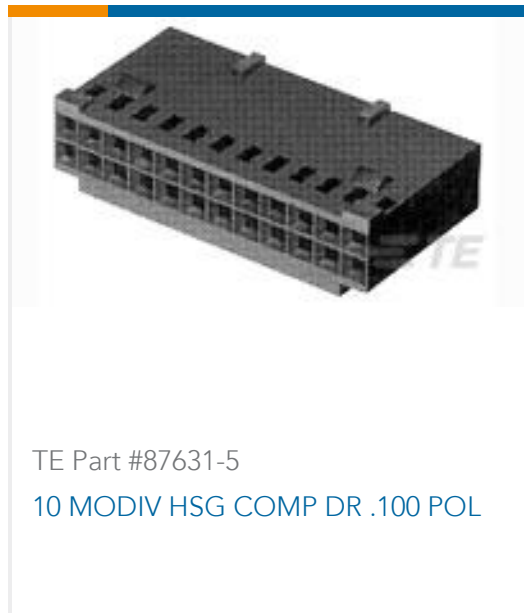
TE Part #87631-5 10 MODIV HSG COMP DR .100 POL