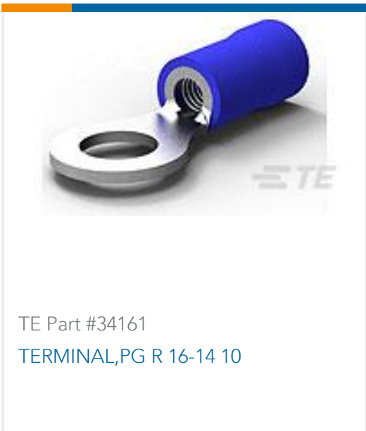
TE Part #34161 TERMINAL,PG R 16-14 10