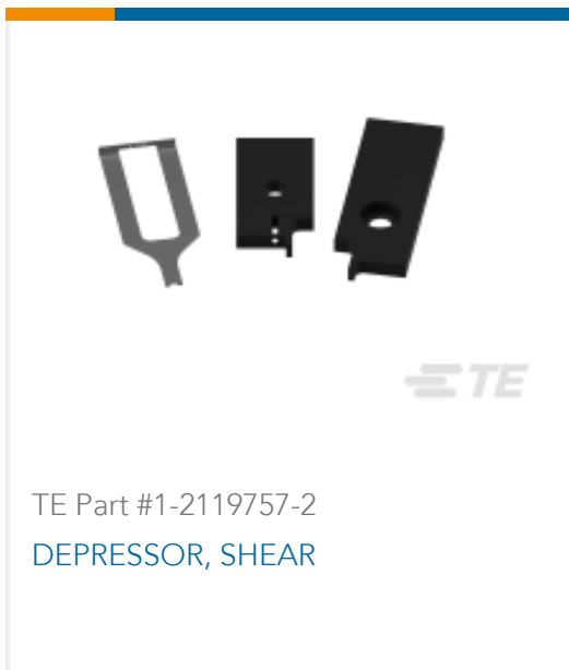
TE Part #1-2119757-2 DEPRESSOR, SHEAR