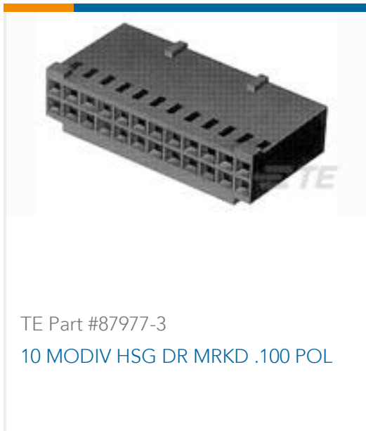
TE Part #87977-3 10 MODIV HSG DR MRKD .100 POL