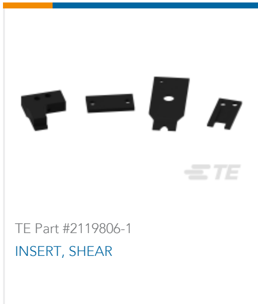
TE Part #2119806-1 INSERT, SHEAR