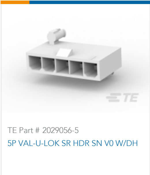
TE Part # 2029056-5 5P VAL-U-LOK SR HDR SN V0 W/DH