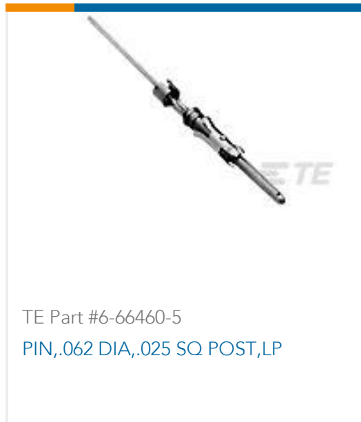
TE Part #6-66460-5 PIN,.062 DIA,.025 SQ POST,LP