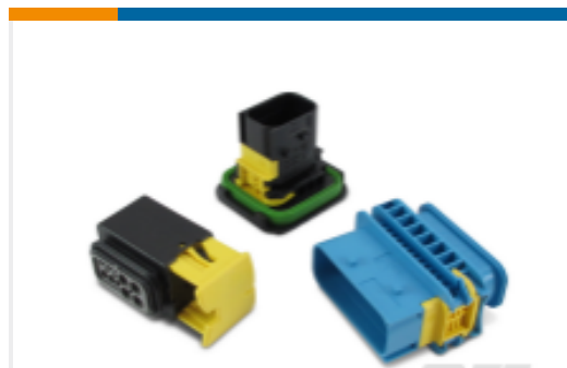
TE Part #1-1564520-1 Heavy Duty Sealed Connector Series Housings