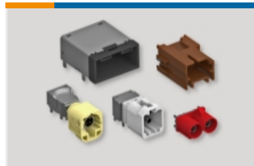
Data Connectivity Headers(2)