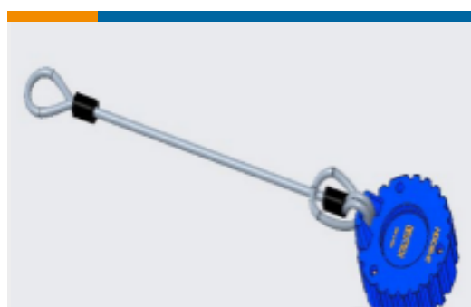
TE Part #HDC16-6-LA DUST CAP, 6P, REC, GRY, LANYARD, HD10