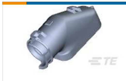
TE Part #1670865-1 COVER,90