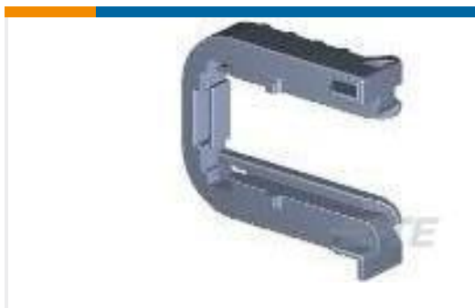
TE Part #1564562-2 SLIDE,TAB HSG GROUP D