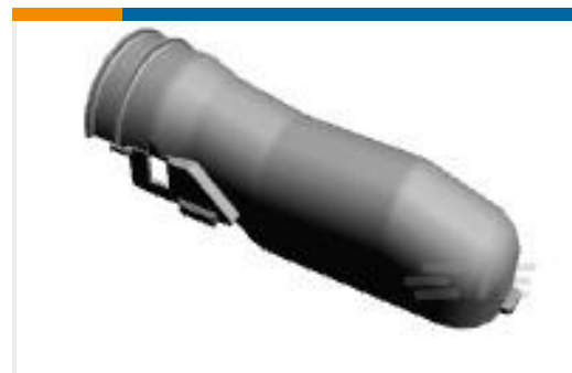
TE Part #1418882-1 COVER FOR 62POS.REC.HSG