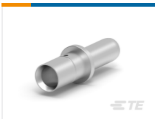
TE Part #SRK-PC-080-25-601 PIN, SOLID, SIZE M8, 25mm2, AG