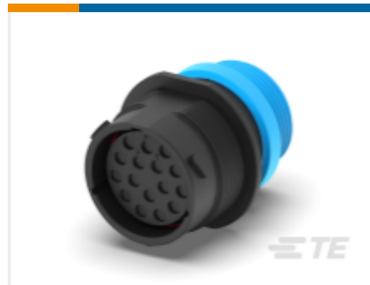
TE Part #HDP24-24-16SE-L015 REC, 16P, BLK, E, THD, 12, S