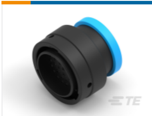
TE Part #YHDP26-24-35PEL017 PLG, 35P, BLK, E, RNG, 16/20, P