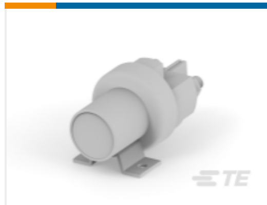
TE Part #K1008699 Relay 26-60-05