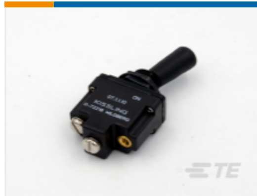
TE Part #K1007153 Toggle Switch 08-1-1-13