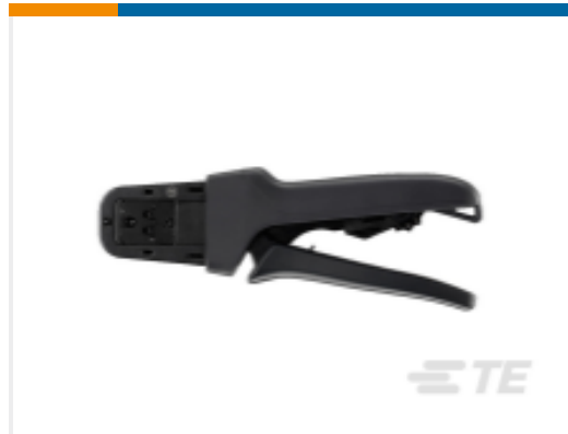
TE Part #DTT-20-03 CRIMP TOOL