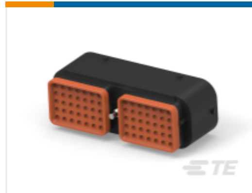
TE Part #DRC16-70SBE-P013UK PLG, 70P, BLK, E, SEAL BOND, B