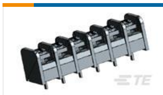
TE Part #3-1437664-8 NC6-P108-06=NC6 ASSEMBLY