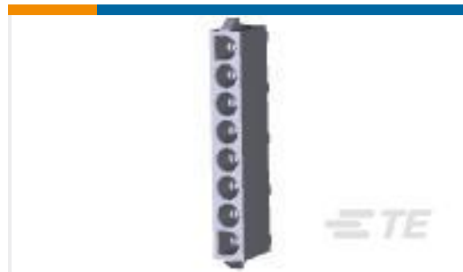
TE Part #643410-1 08P UMNL PIN HDR ASSY POL 94VO