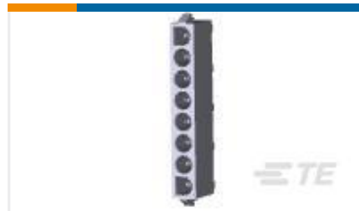
TE Part #641828-1 08P UMNL PIN HDR ASSY 94VO