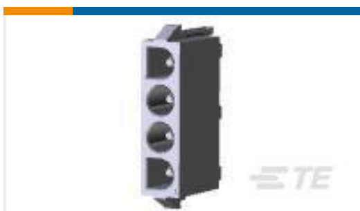
TE Part #641967-1 04P UMNL PIN HDR ASSY POL NATL