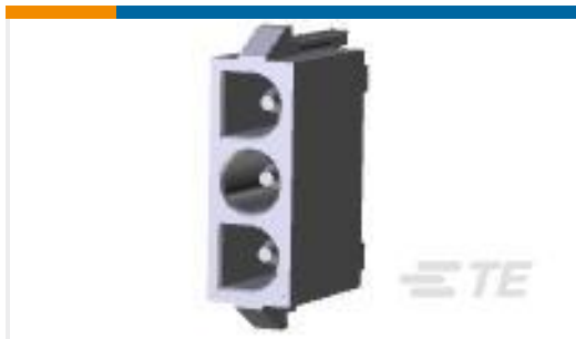
TE Part #641965-1 03P UMNL PIN HDR ASSY V2 NATL