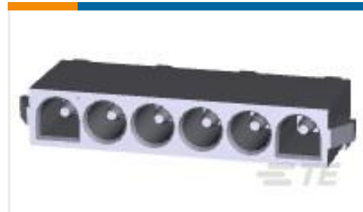
TE Part #641831-1 06P UMNL PIN HDR ASSY 94VO