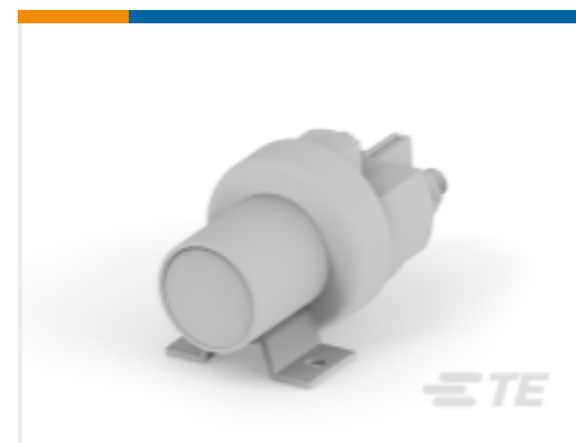
TE Part #K1008699 Relay 26-60-05