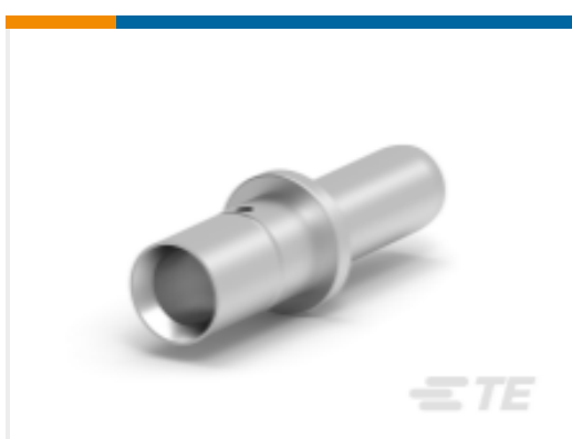
TE Part #SRK-PC-080-25-601 PIN, SOLID, SIZE M8, 25mm2, AG