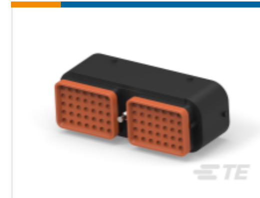
TE Part #DRC16-70SBE-P013UK PLG, 70P, BLK, E, SEAL BOND, B