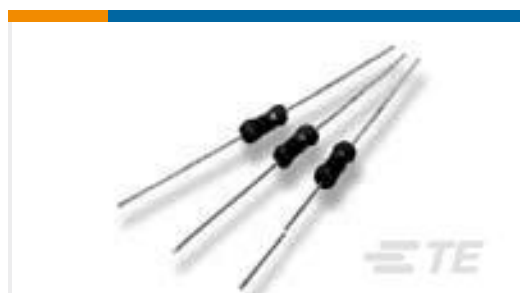
TE Part #3-1879350-2 RR01 5% 4R3 AMMO