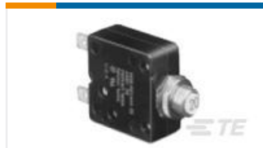
TE Part #1-1393249-2 W58-XB1A4A-20=W58