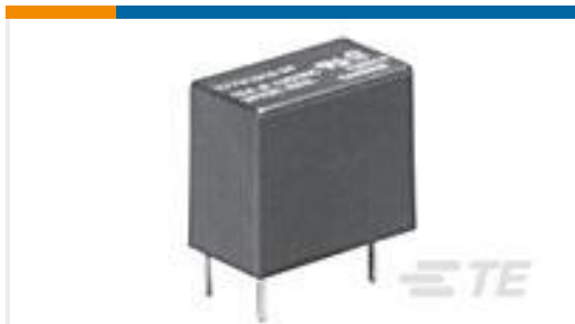
TE Part #1-1393194-9 T77V1D10-12