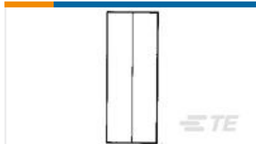
TE Part #34138 SPLICE,SOLIS PARA 12-10