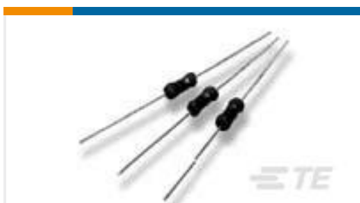
TE Part #1879353-7 RR02 5% 7K5 AMMO