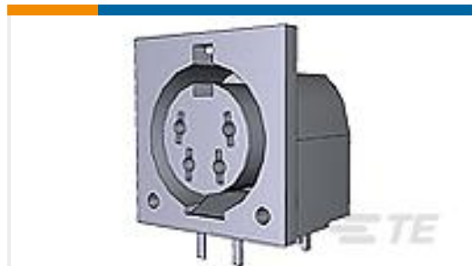
TE Part #5211508-1 4 CIRC DIN RCPT GRND CLIP