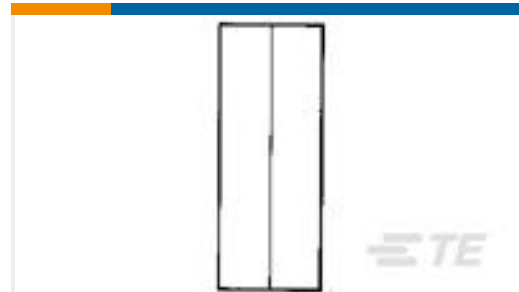
TE Part #34137 SPLICE,SOLIS PARA BRZD 16-14