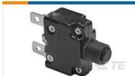
TE Part #1423675-3 W57-XB7A4A10-5=CKTBKR,THERM,PB