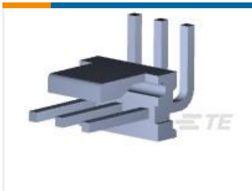
TE Part #640387-3 03P MTA156 HDR ASSY SQ R/A