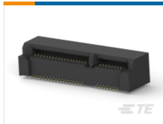
TE Part #1759547-1 mSATA/mini PCI-E 7H G/F