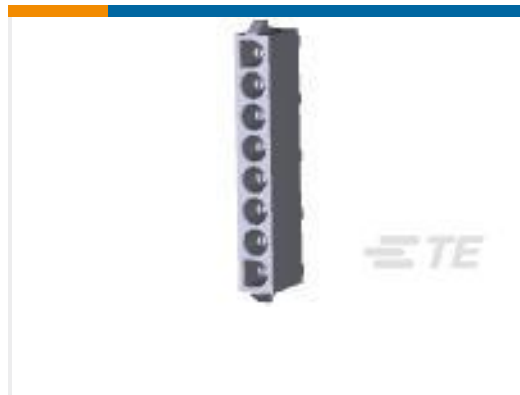
TE Part #643410-1 08P UMNL PIN HDR ASSY POL 94VO