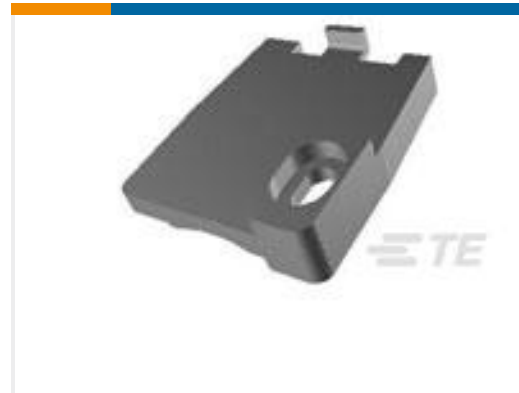
TE Part #641945-1 03P UMNL STR/REL