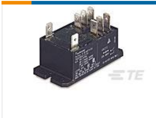
TE Part #7-1393211-1 T92P7D22-24