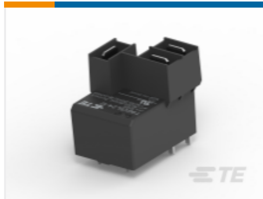
TE Part #1558676-3 T9GS1L24-12