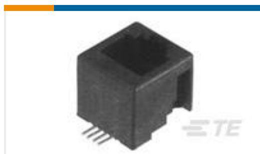
TE Part #1-338088-3 8/8 INV.MOD.JACK