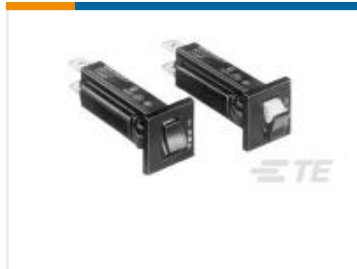
TE Part #3-1393250-3 W28-XQ1A-20=W28