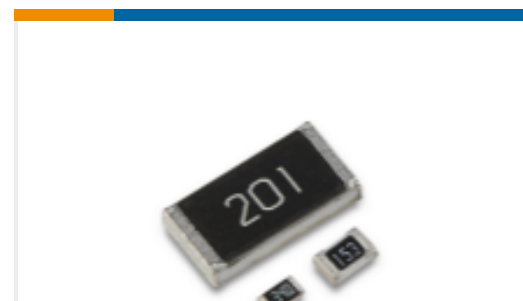
TE Part #2-2176329-9 CRGP 1210 2K2 1%