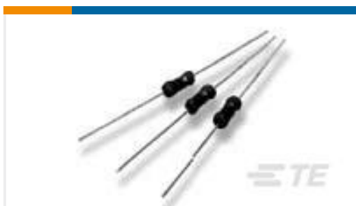
TE Part #6-1625892-6 3W SM M/OX 5% 68K