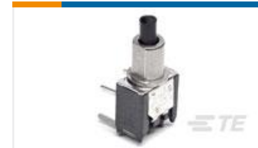
TE Part #1825097-1 TPB11CGPC004