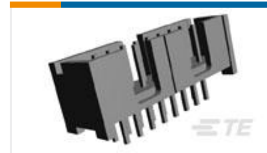
TE Part #103308-1 010 LOPRO HDR SP 15DP