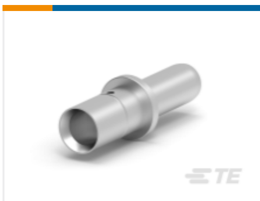
TE Part #SRK-PC-080-25-601 PIN, SOLID, SIZE M8, 25mm2, AG