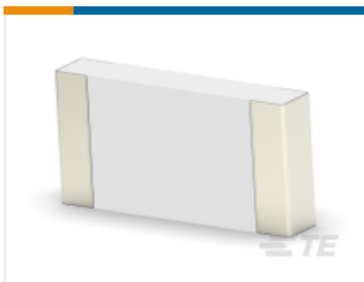
TE Part #2-2176245-2 CRGS1206 5% 56R