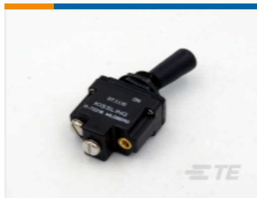
TE Part #K1007153 Toggle Switch 08-1-1-13