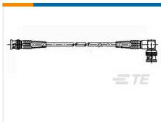
TE Part #1337772-4 50/OHM COAX BNC STR PLUG ELB P