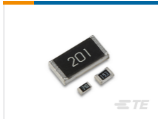
TE Part #2176329-4 CRGP 1210 18R 1%