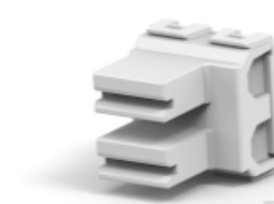
TE Part # 1969900-1 250 FASTON HSG., FLAG, REC., 2 POS, NATRUAL