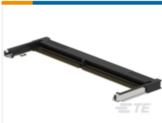
TE Part #2309407-1 DDR4 SODIMM 260P 4.0H STD