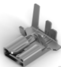
TE Part # 2238171-3 250 FASTON, FLAG, REC., 22-12 AWG, TPBR