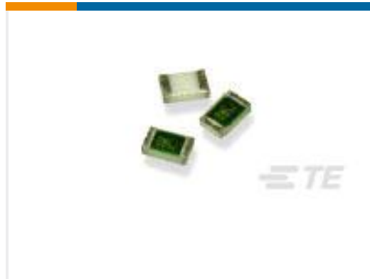
TE Part #7-1879208-9 CPF 0402 18K 0.1% 25PPM 1K RL