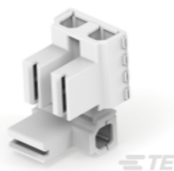
TE Part # 2238270-1 HSG, RECEP, 250 FASTON FLAG, 3P, T9G

Also in the Series | Potter & Brumfield T9G