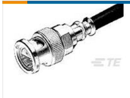
TE Part #5332225-5 PLUG, TWIN BNC,