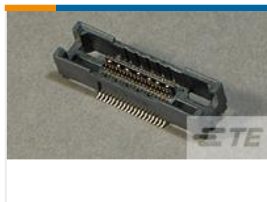
TE Part #2-767004-2 MICT,RECPT,038,ASSY,.025,REC