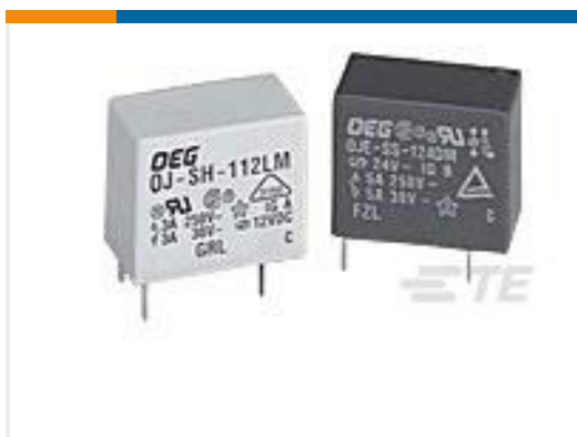
TE Part #1461403-5 OJE-SH-124LMH,000