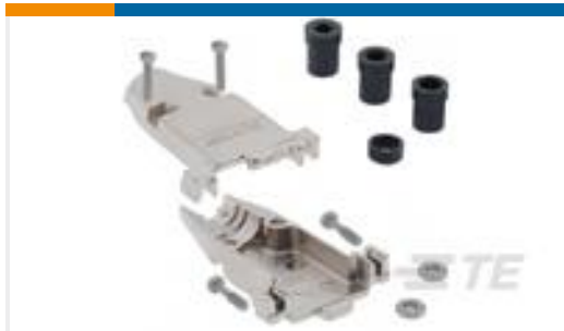
TE Part #5748676-1 DIE CAST CBL CLMP KIT,SZ 1