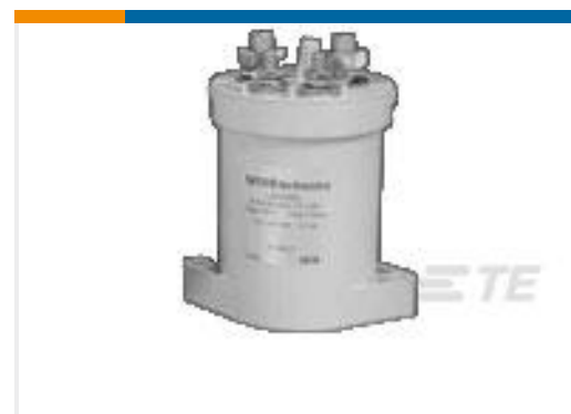
TE Part #7-1618391-4 LEV200ABNAA=RELAY, SPST-NO