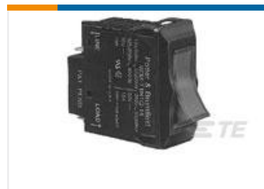
TE Part #1393248-7 W33-S1N1Q-15=W33