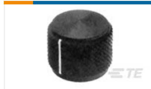
TE Part #6-1437621-9 KD1250B1/4=KNOB BLK DIAMOND KN