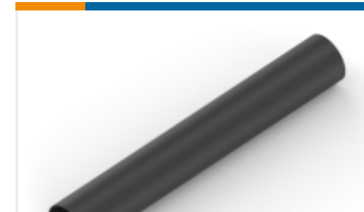
TE Part #NB09542001 ATUM 3:1 dual wall heat shrink tubing