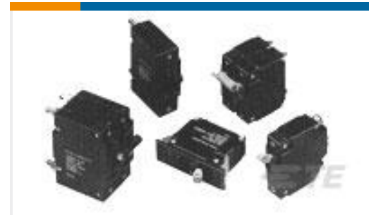
TE Part #7-1393254-0 W92-X112-15=M6/M7/M9/W6/W7