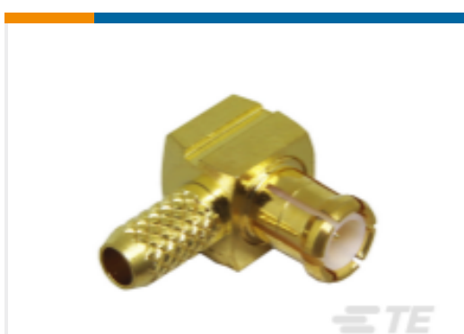
TE Part #CONMCX012 MCX Plug 50 Ohm Cable Crimp