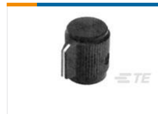
TE Part #9-1437622-9 KPN900B1/4=KNOB BLK W/POINTER