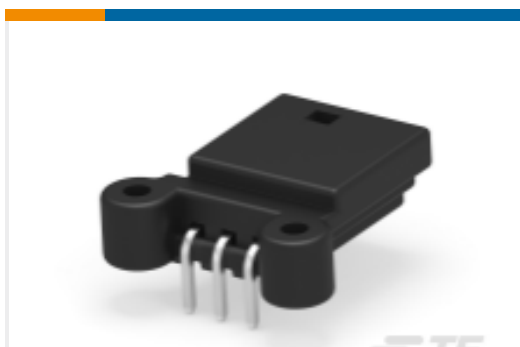
TE Part #1-967162-3 3pos MQS .63 header 90deg THR