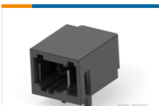
TE Part #2320201-1 1-PORT MATENET HDR ASSY, 90DEG, COD A