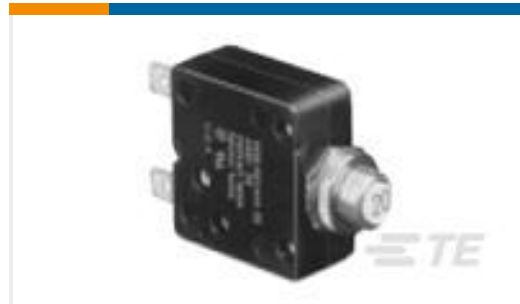
TE Part #1-1393249-8 W58-XB1A4A-4=W58