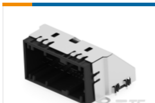
TE Part #1-2293127-1 42POS,MIXED,HEADER ASSY,REFLOW