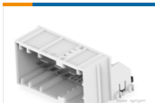
TE Part #2293127-2 42POS,MIXED,HEADER ASSY,REFLOW