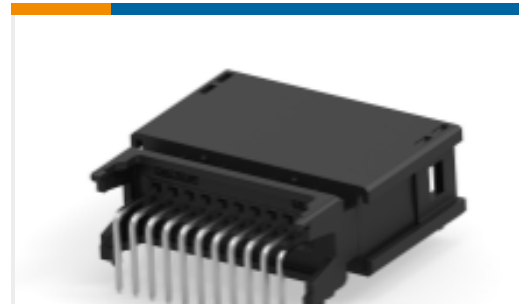
TE Part #2208165-1 20POS,NANO MQS,HEADER ASSY, CODA