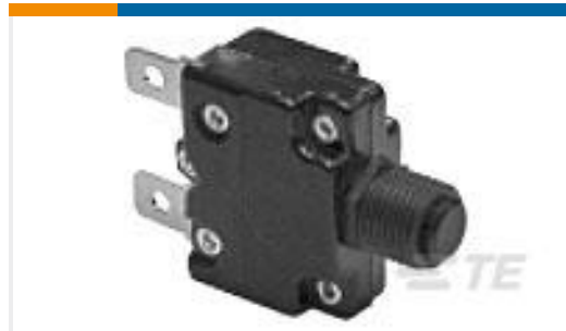
TE Part #1423675-3 W57-XB7A4A10-5=CKTBKR,THERM,PB