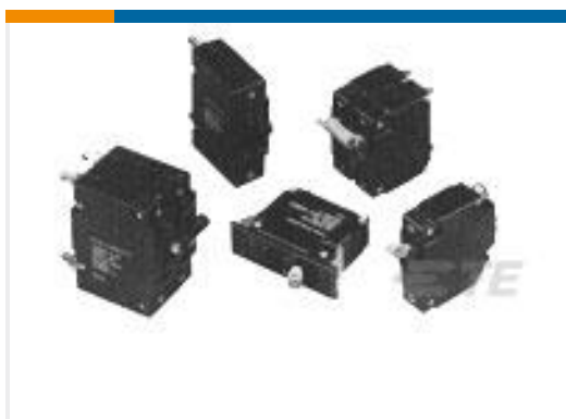
TE Part #7-1393254-0 W92-X112-15=M6/M7/M9/W6/W7