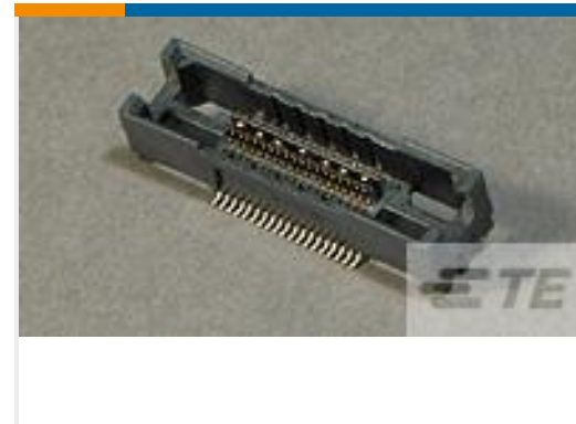
TE Part #2-5767004-2 MICTOR RECEPT ASSY, 38 POS.