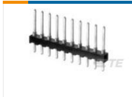
TE Part #87224-3 03 MODII HDR SRST UNSHRD .100