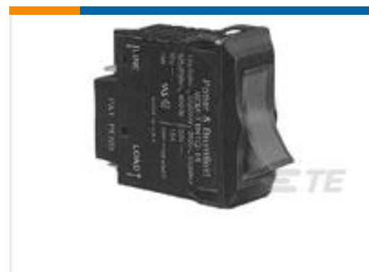
TE Part #1393248-7 W33-S1N1Q-15=W33