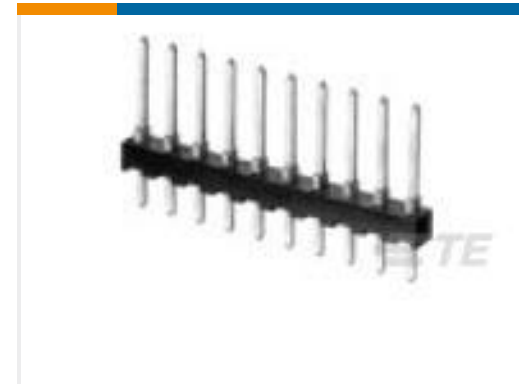
TE Part #87224-2 02 MODII HDR SRST UNSHRD .100