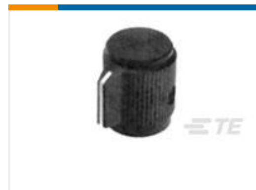
TE Part #9-1437622-9 KPN900B1/4=KNOB BLK W/POINTER